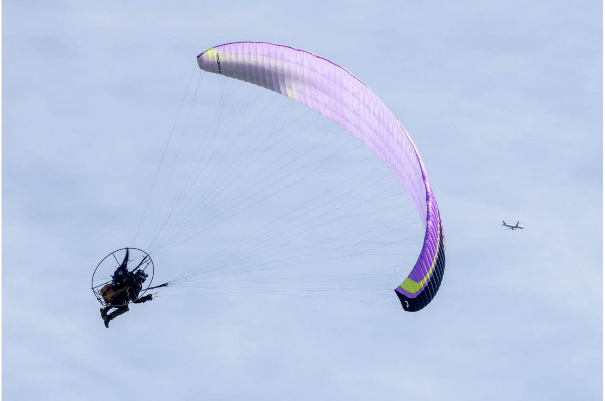
12 October, 12.29pm. A carefree flying day at the beach.