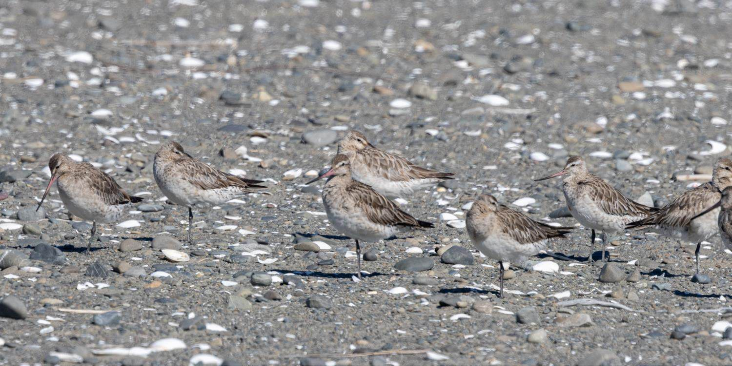
12 October, 10.23am. Small flock of godwits near BBG and WFT.