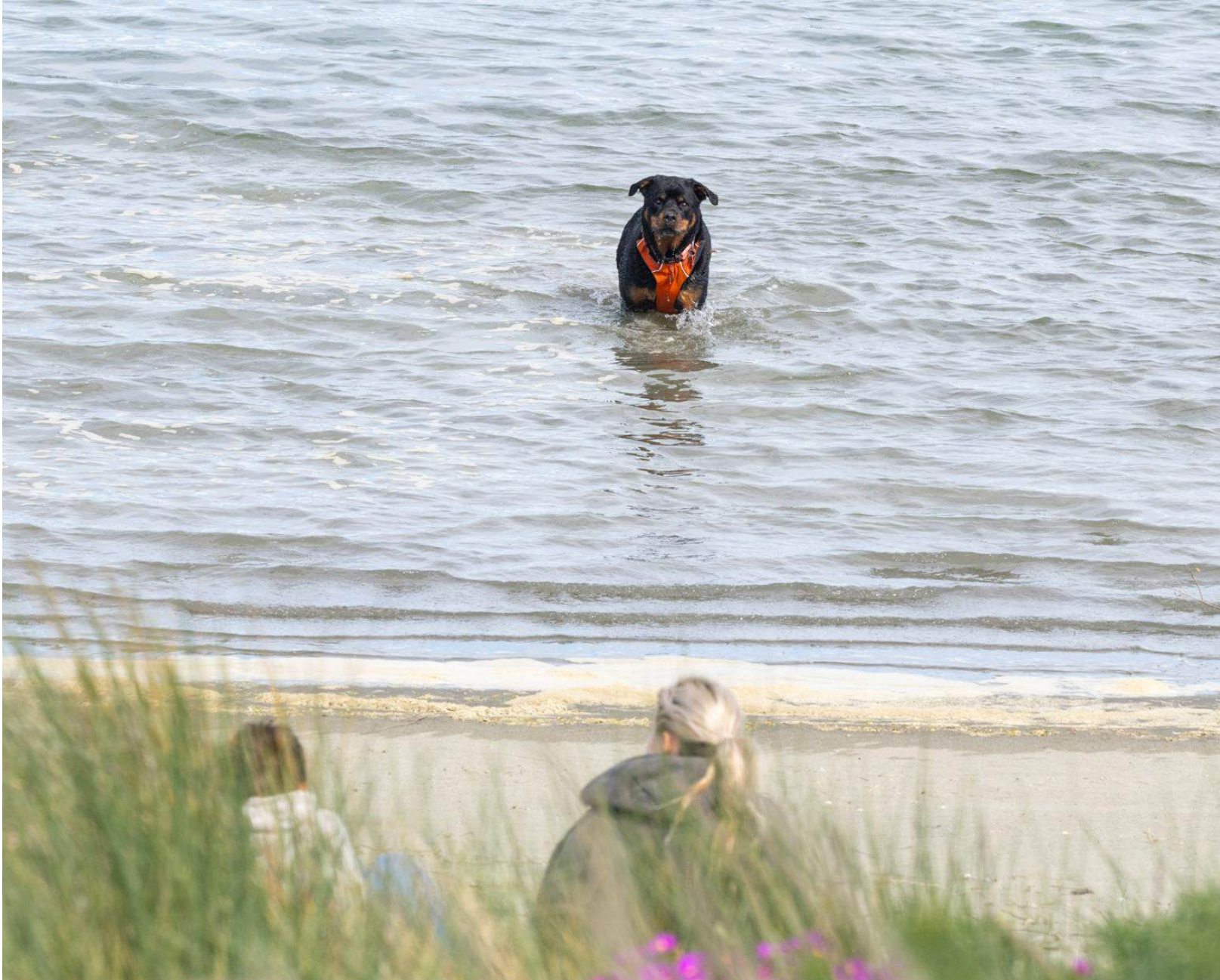
9 October, 10.35am. Dog swimming in estuary where it is prohibited.