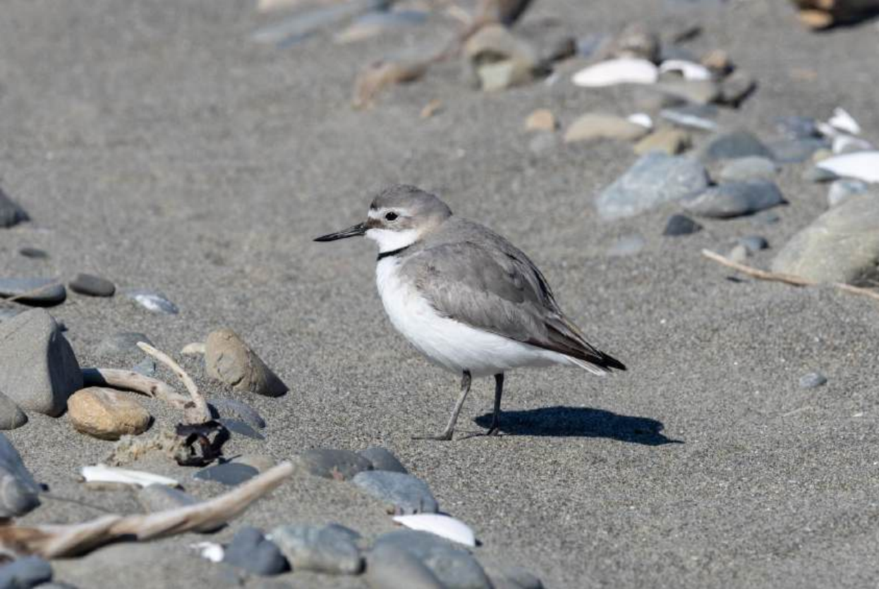
12 October, 10.14am. Wrybill walking through 4wd track.