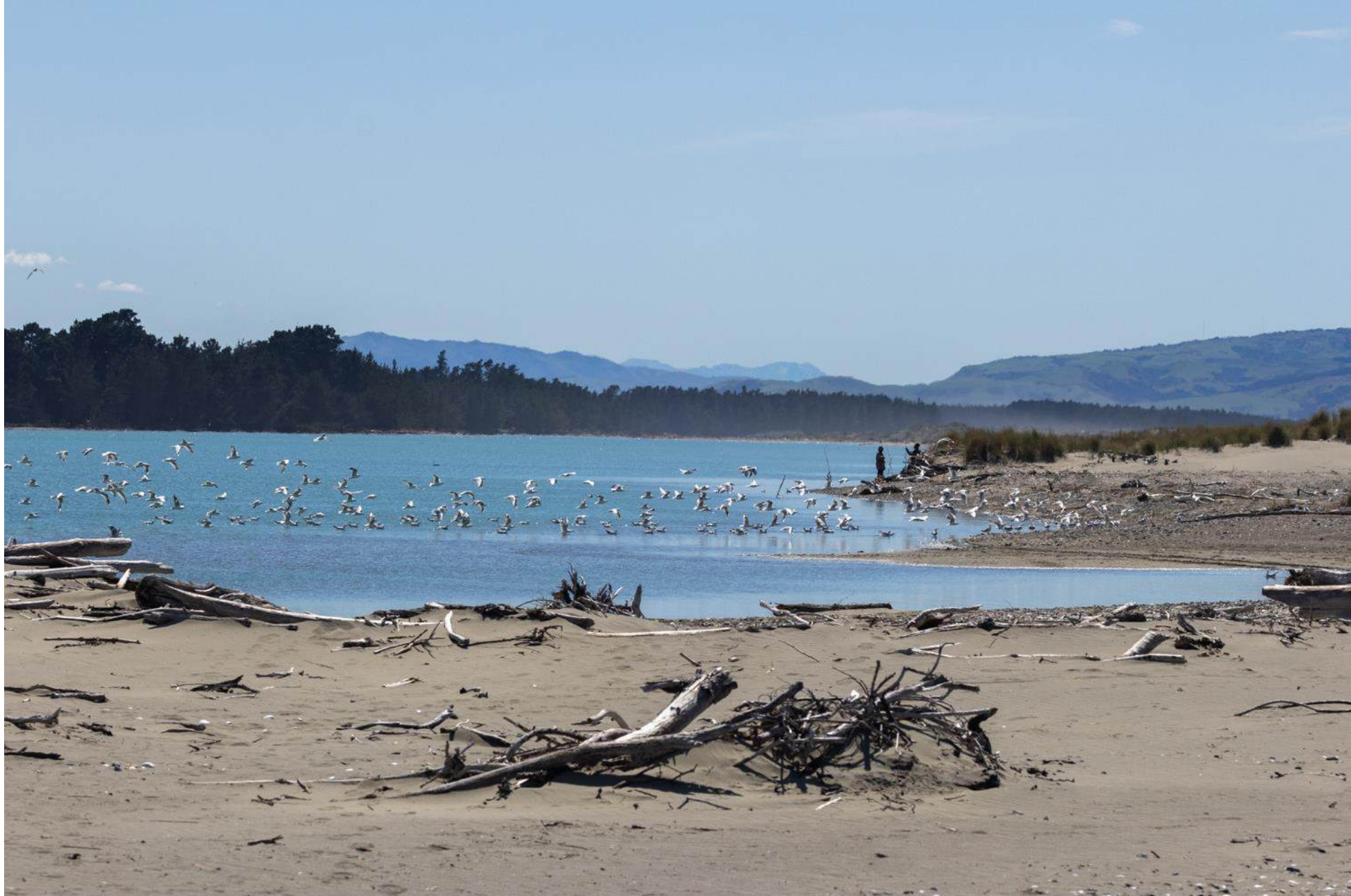
12 October, 12.21pm. Ultralight scares BBG and WFT into the air.