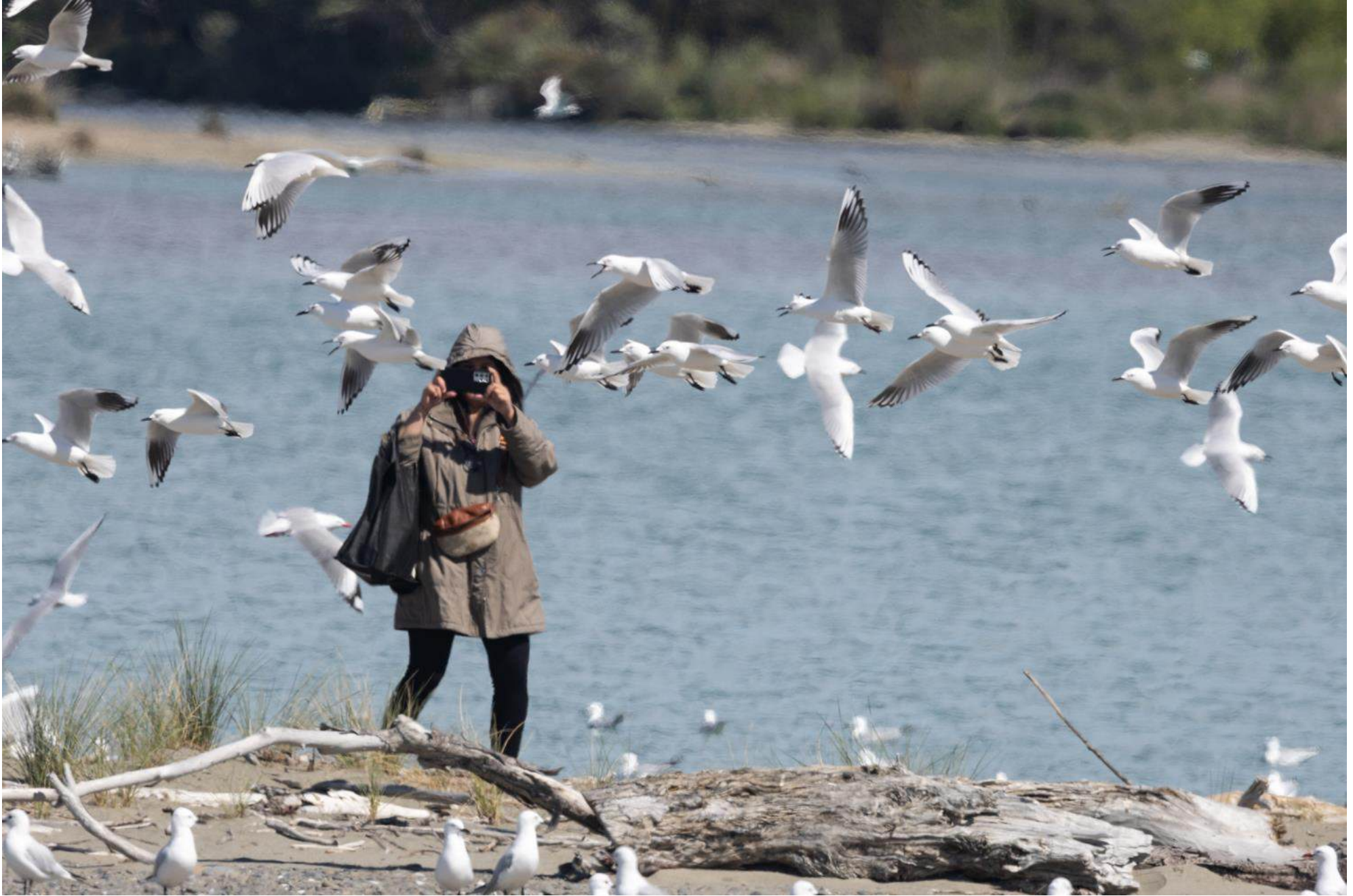
12 October, 11.53am. Person passes through BBG and WFT roosting/nesting area.