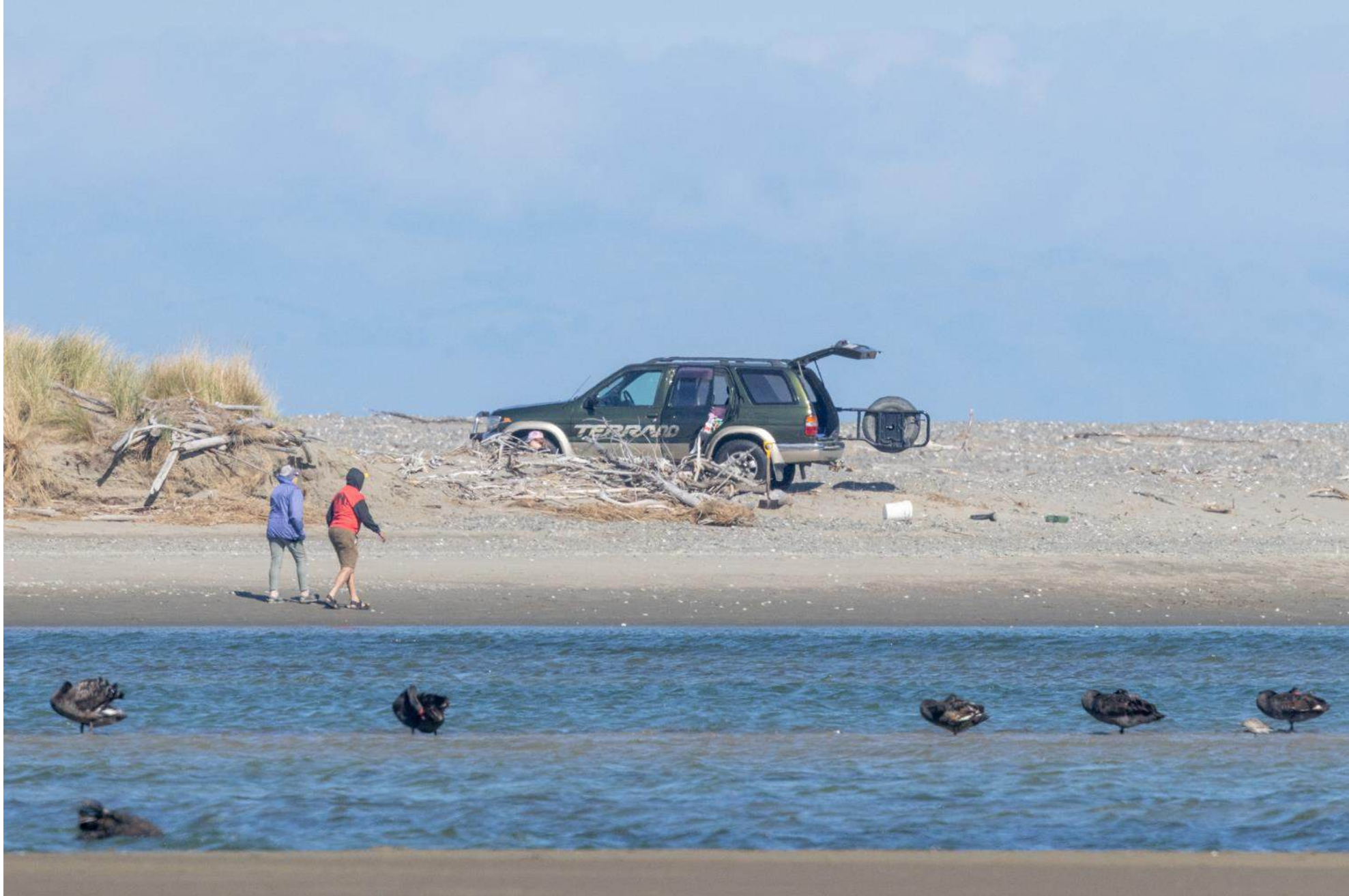
5 October, 3.29pm. 4WD on estuary side of sand spit.