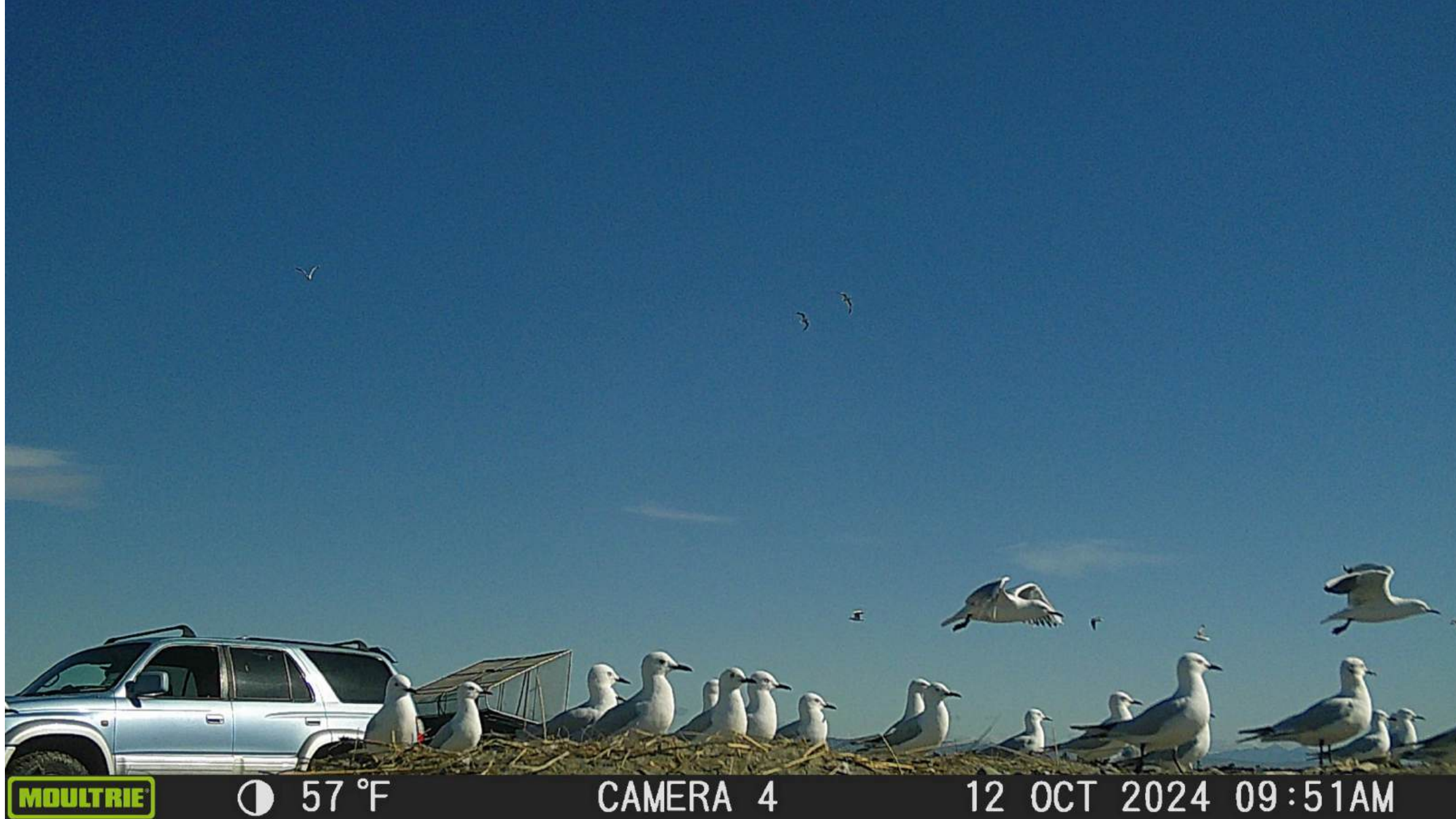
12 October, 9.51am. Another 4wd drives through BBG and WFT area.