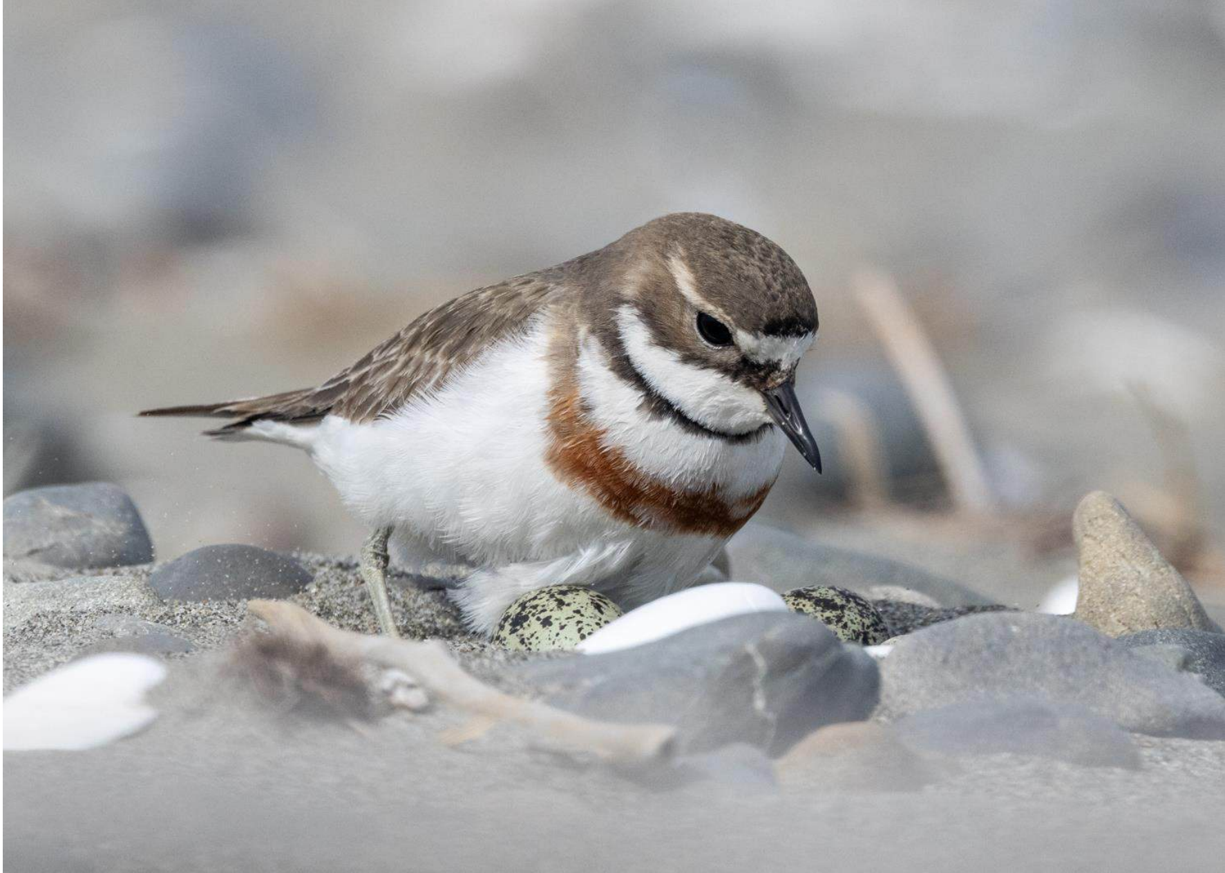
9 October, 10.14am. Banded dotterel nest on spit, one of two.