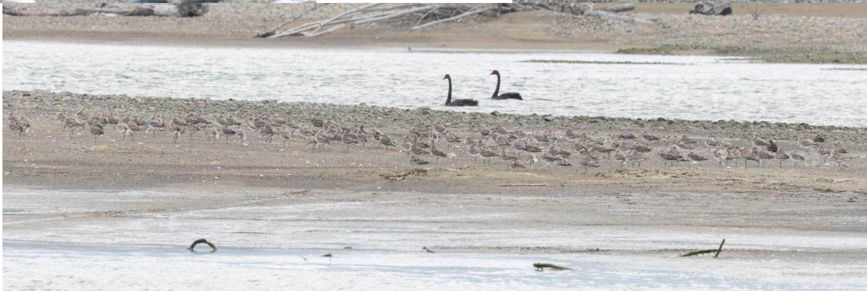
13 October, 3pm. Wrybill and dotterel on spit, godwits roosting on island at high tide.