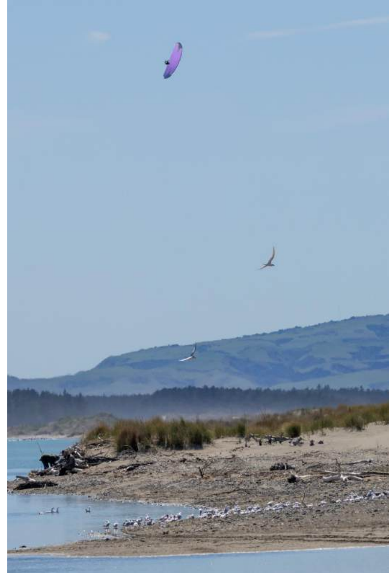
12 October, 12.19pm. Ultralight approaches, much lower than allowed. Circles lower over birds.