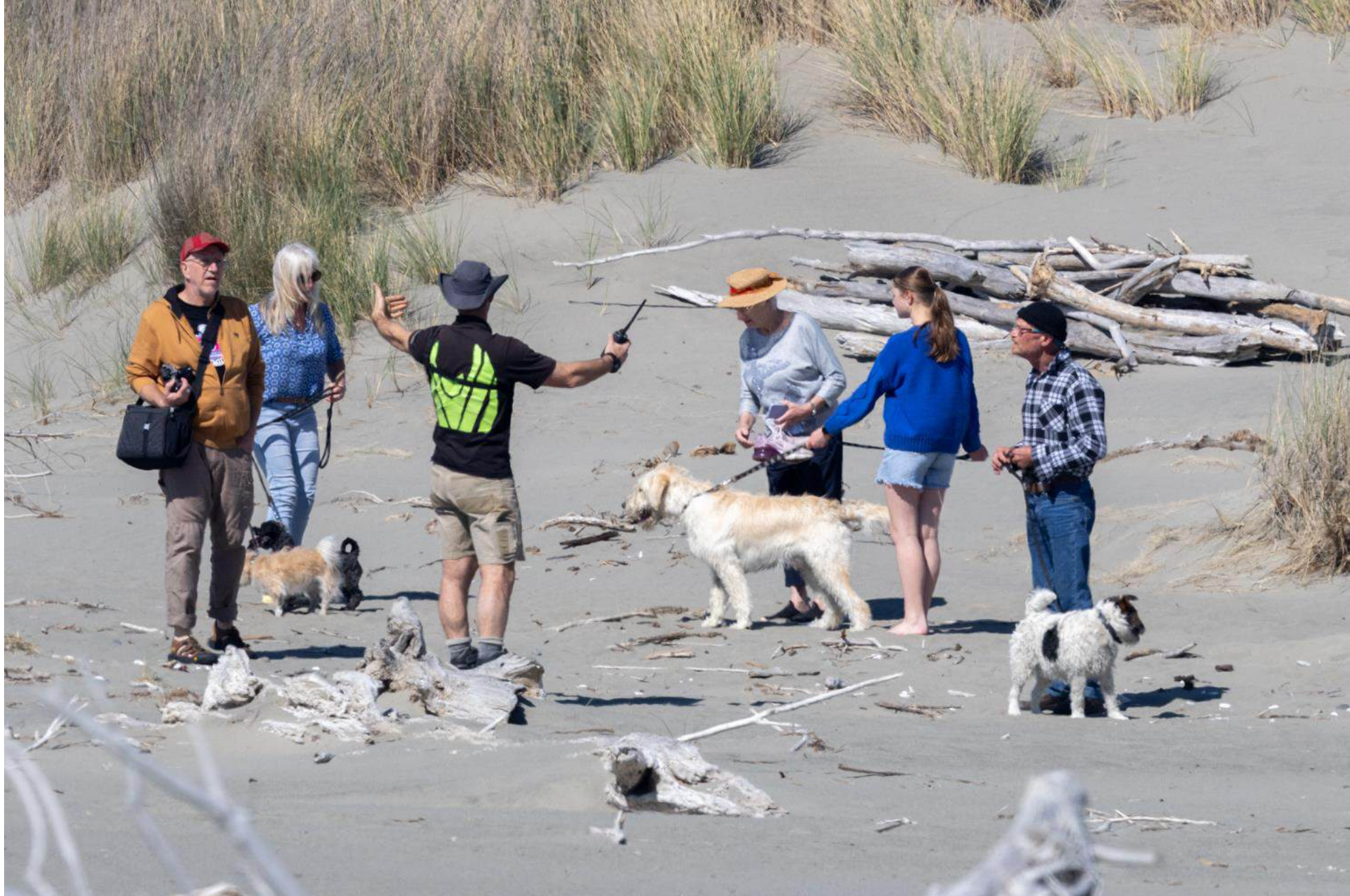
12 October, 11.18am. Dogs past on leash sign, some leashes put on when ranger approached.