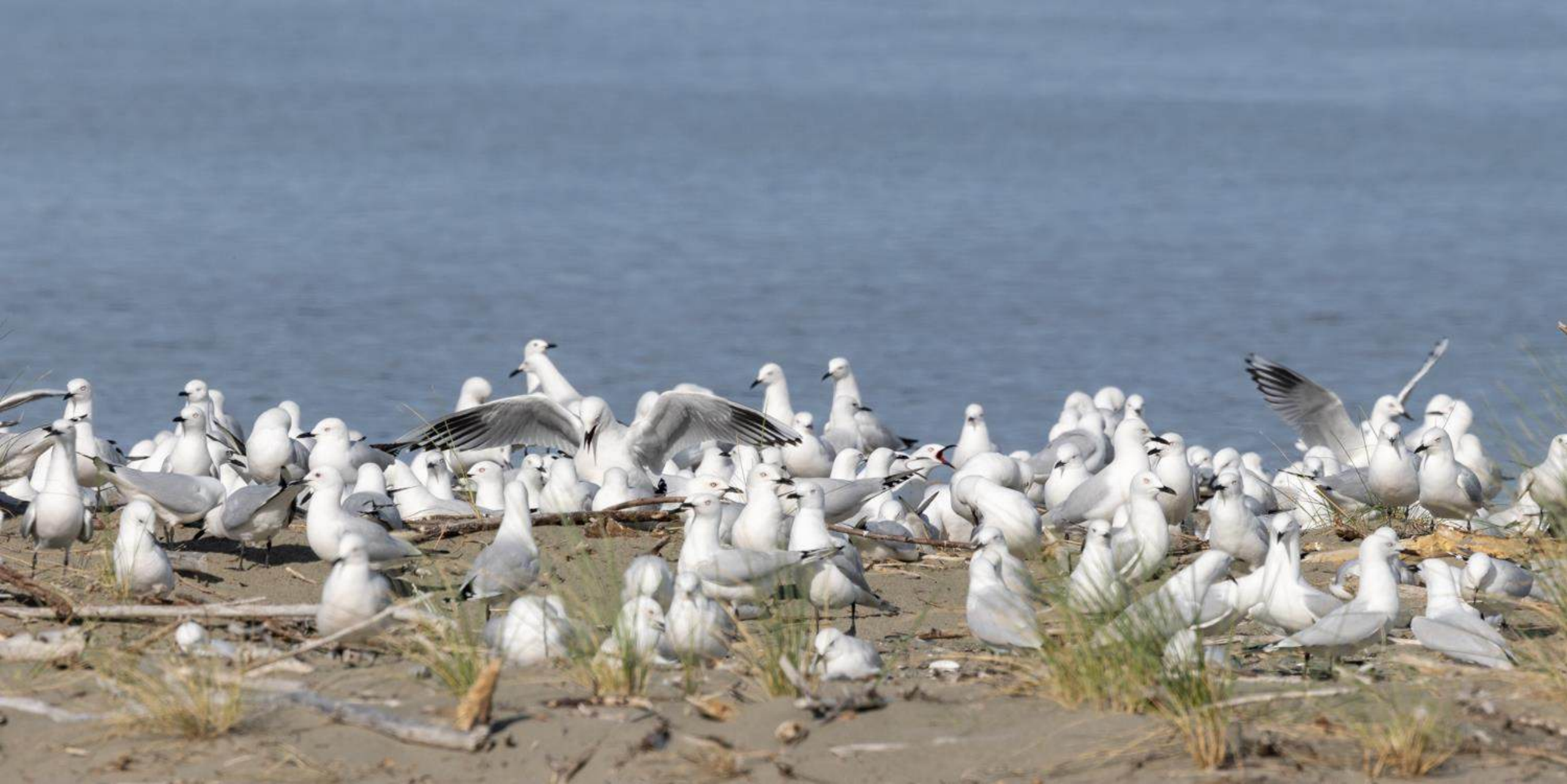
9 October, 9.34am. BBG mating prior to nesting.