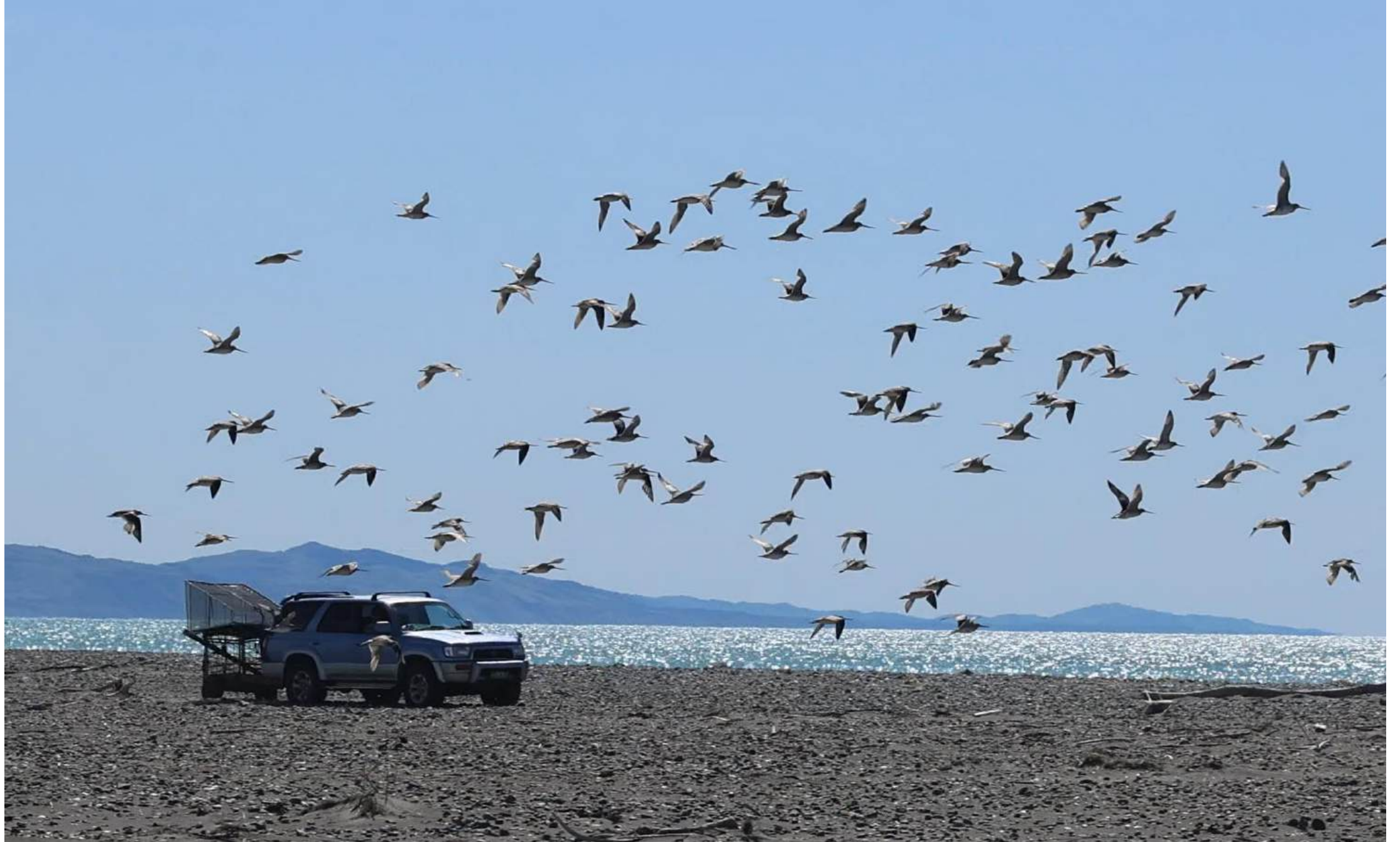
12 October, 11.10am. Ejected vehicle scares godwits into the air.