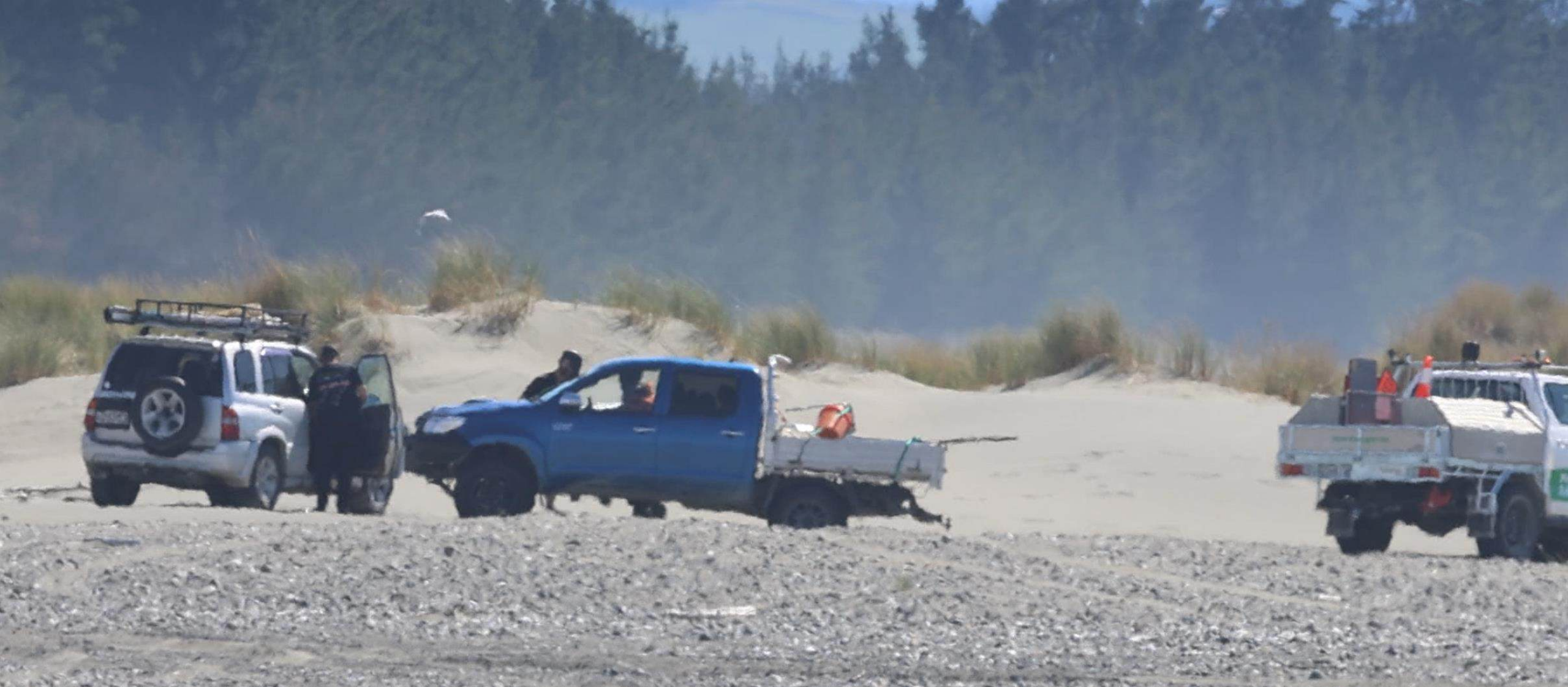
12 October, 11.24am. Ranger speaks to drivers of 2 vehicles.