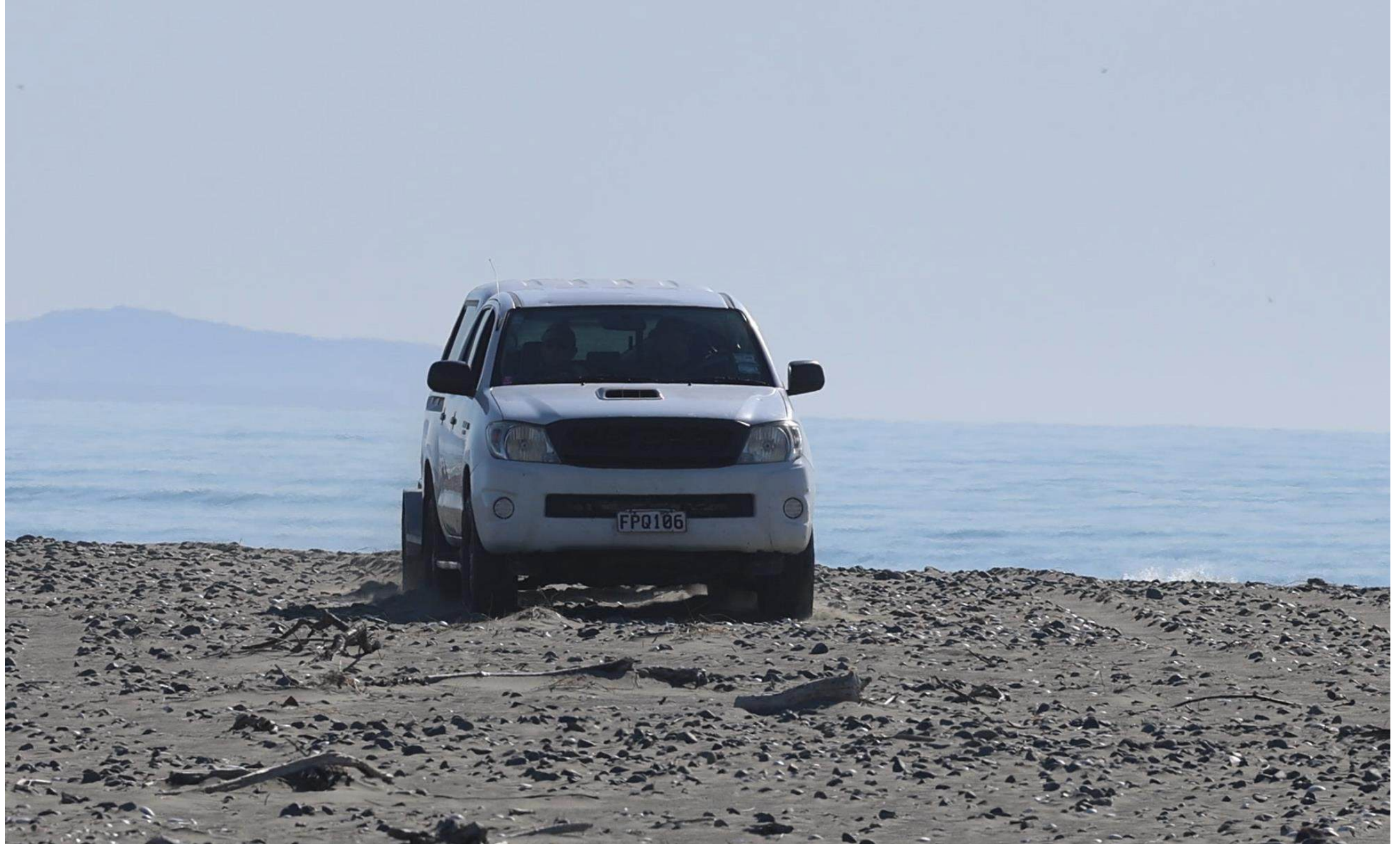
12 October, 9.36am. Another 4wd approaches, making new tracks in nesting and roosting area.