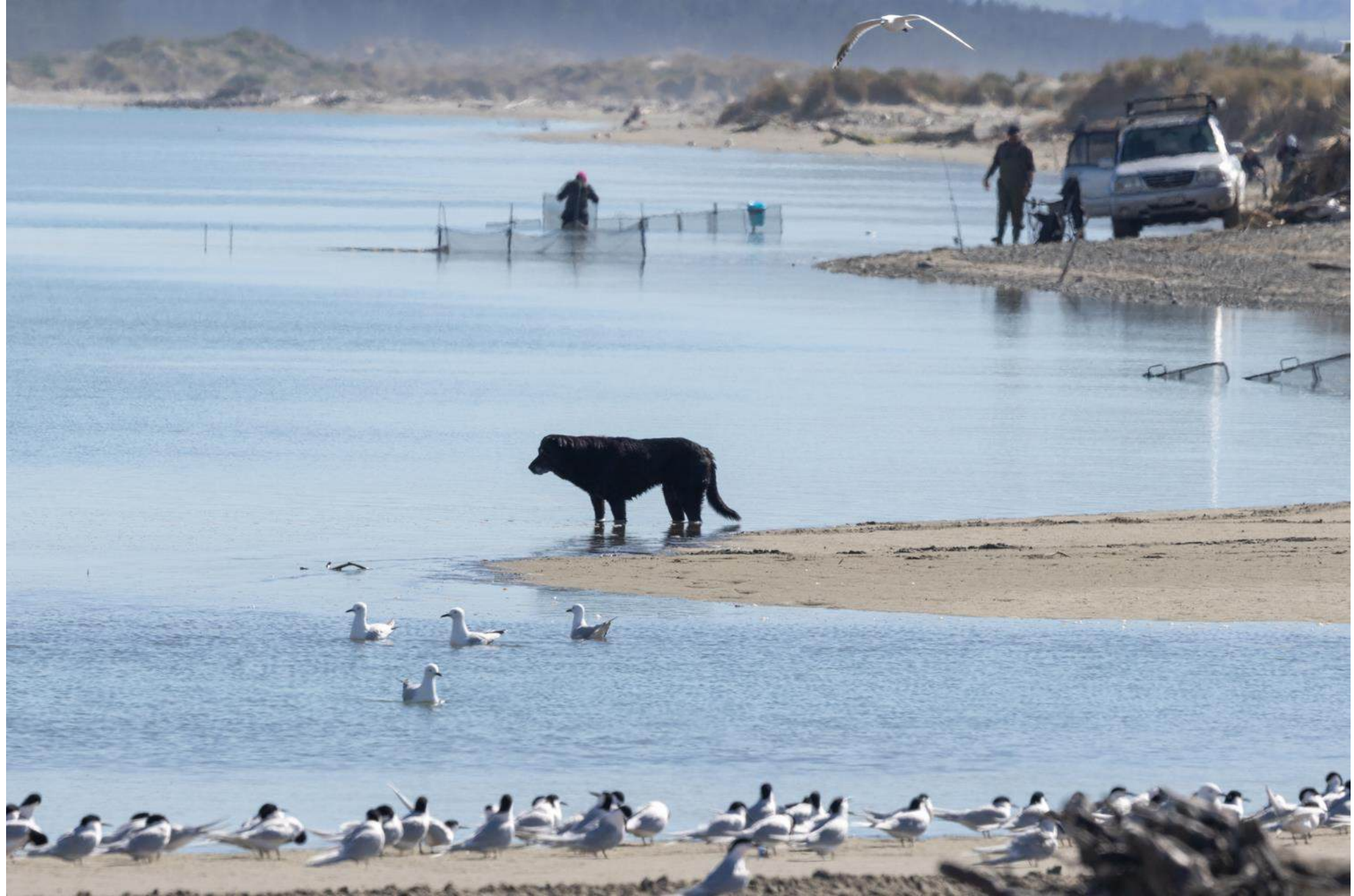
12 October, 10.34am. Dog surveys the busy scenery.