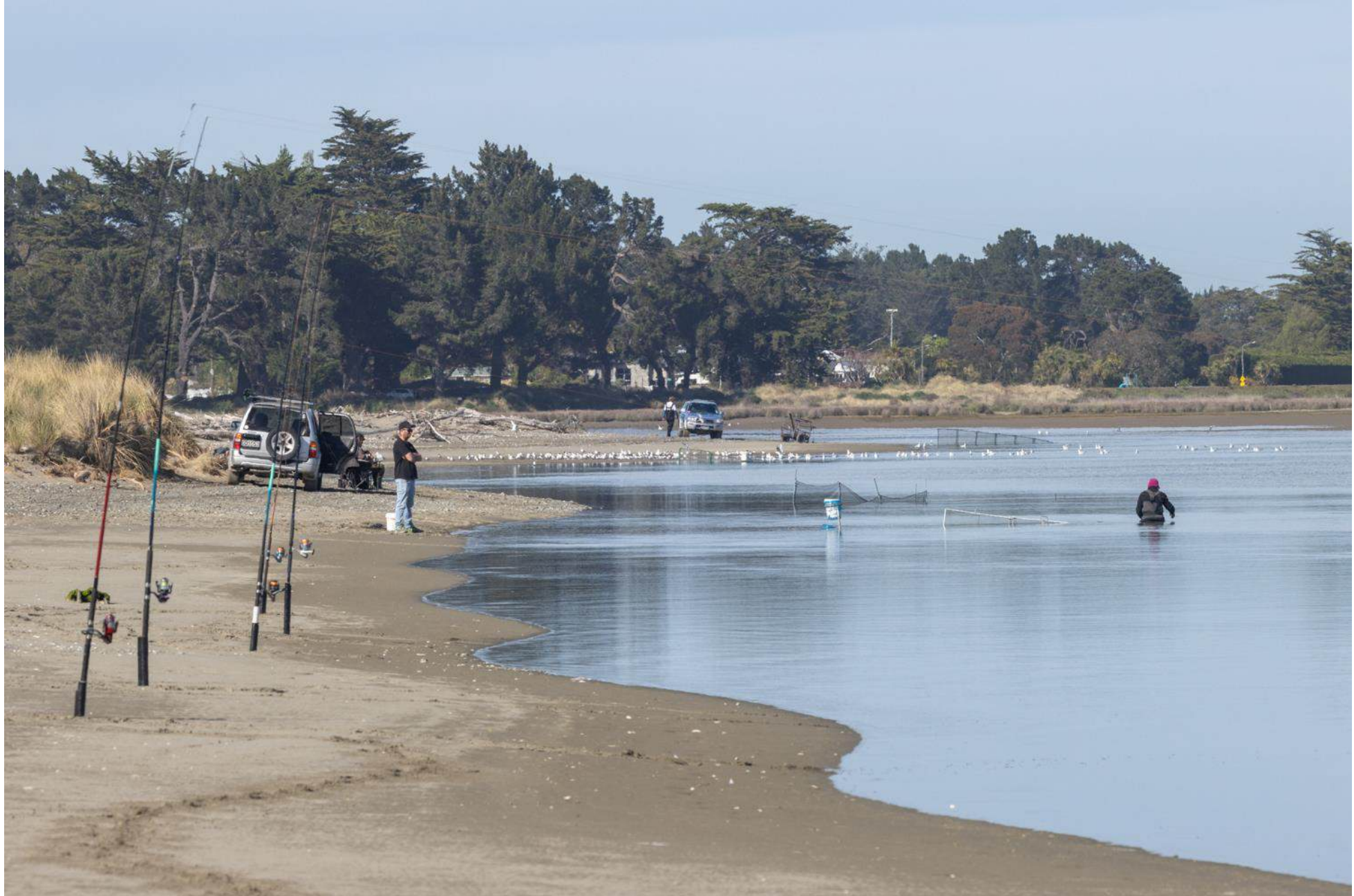
12 October, 10.03am. New whitebaiter starts to set up nets.