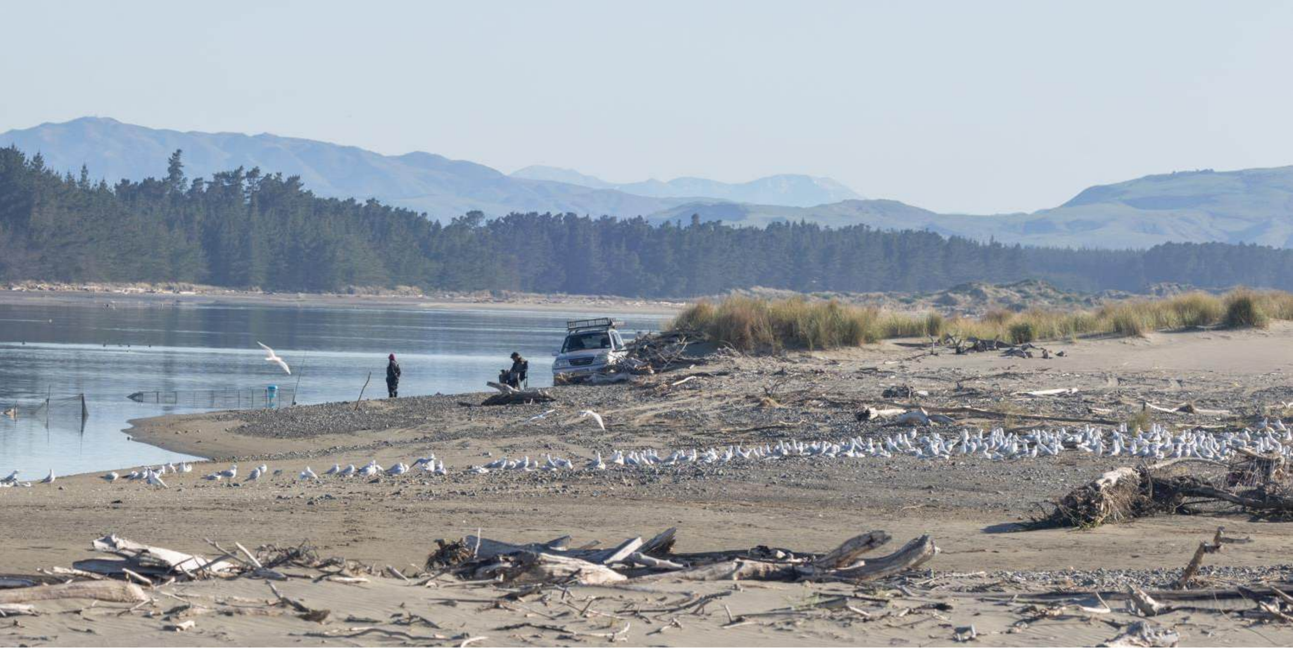
12 October, 8.53am. 4WD on estuary edge.