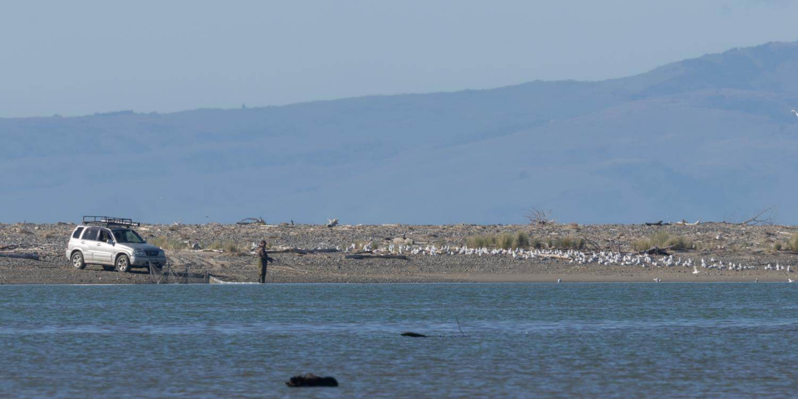
11 October, 9.34am. 4WD on sandspit edge of estuary, close to BBG and WFT.