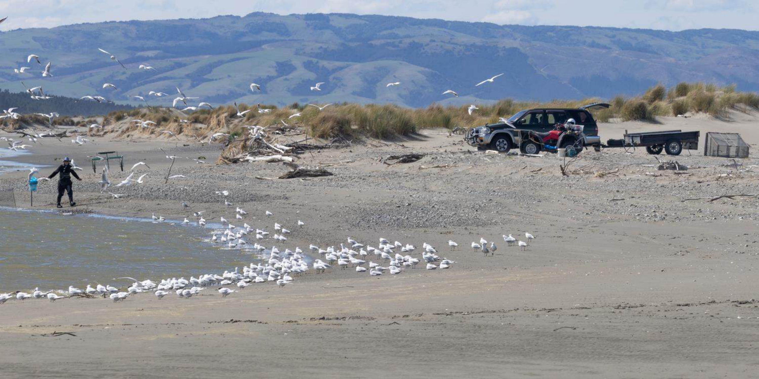
8 October, 3.07pm. BBG deliberately scared off by whitebaiter, estuary side of spit.