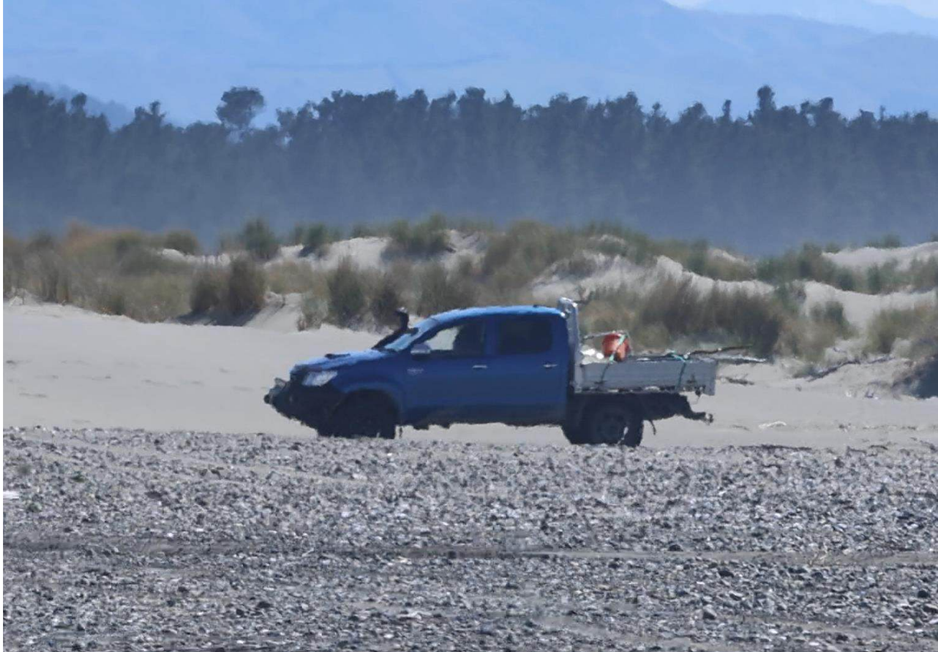
12 October, 11.20am. Another vehicle arrives.