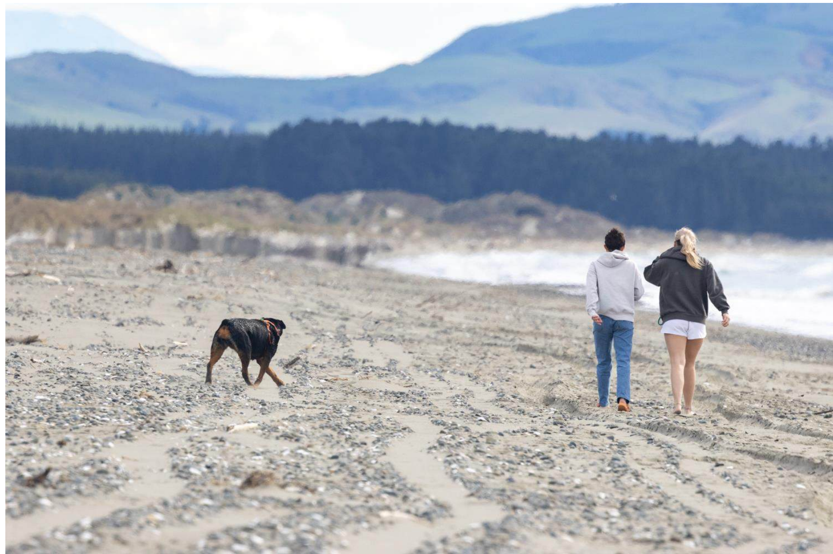
9 October, 10.29am. Dog off leash past sign, heading towards dotterel nests.