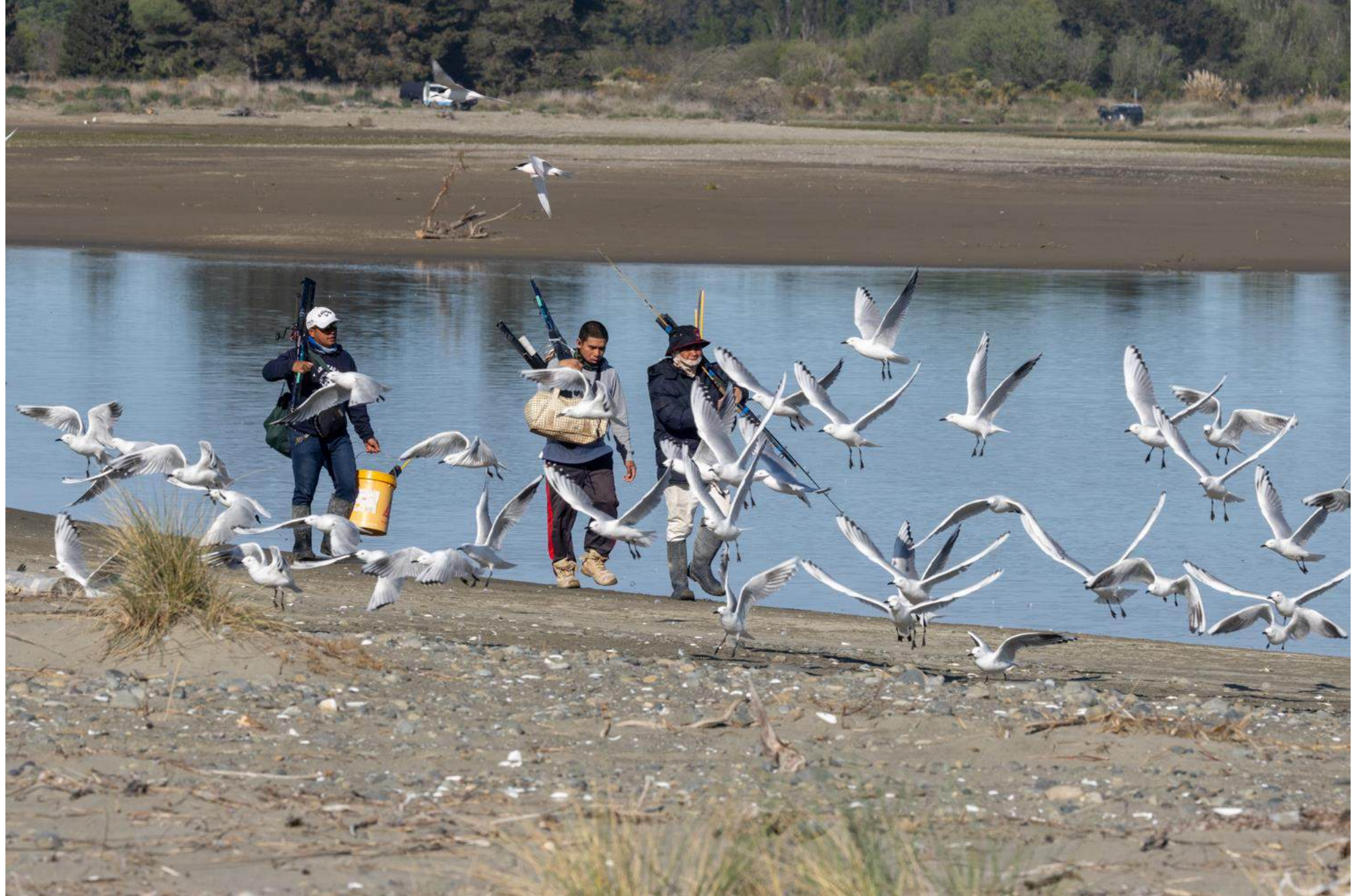
12 October, 9.32am. Fishermen scare BBG.