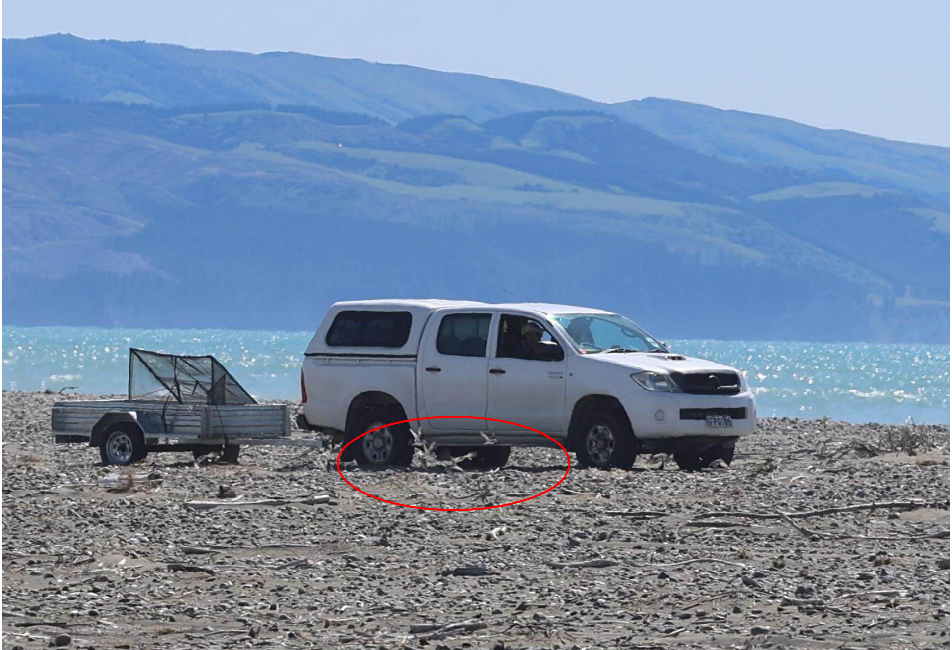
12 October, 11.19am. Ejected vehicle almost runs over resting wrybills.