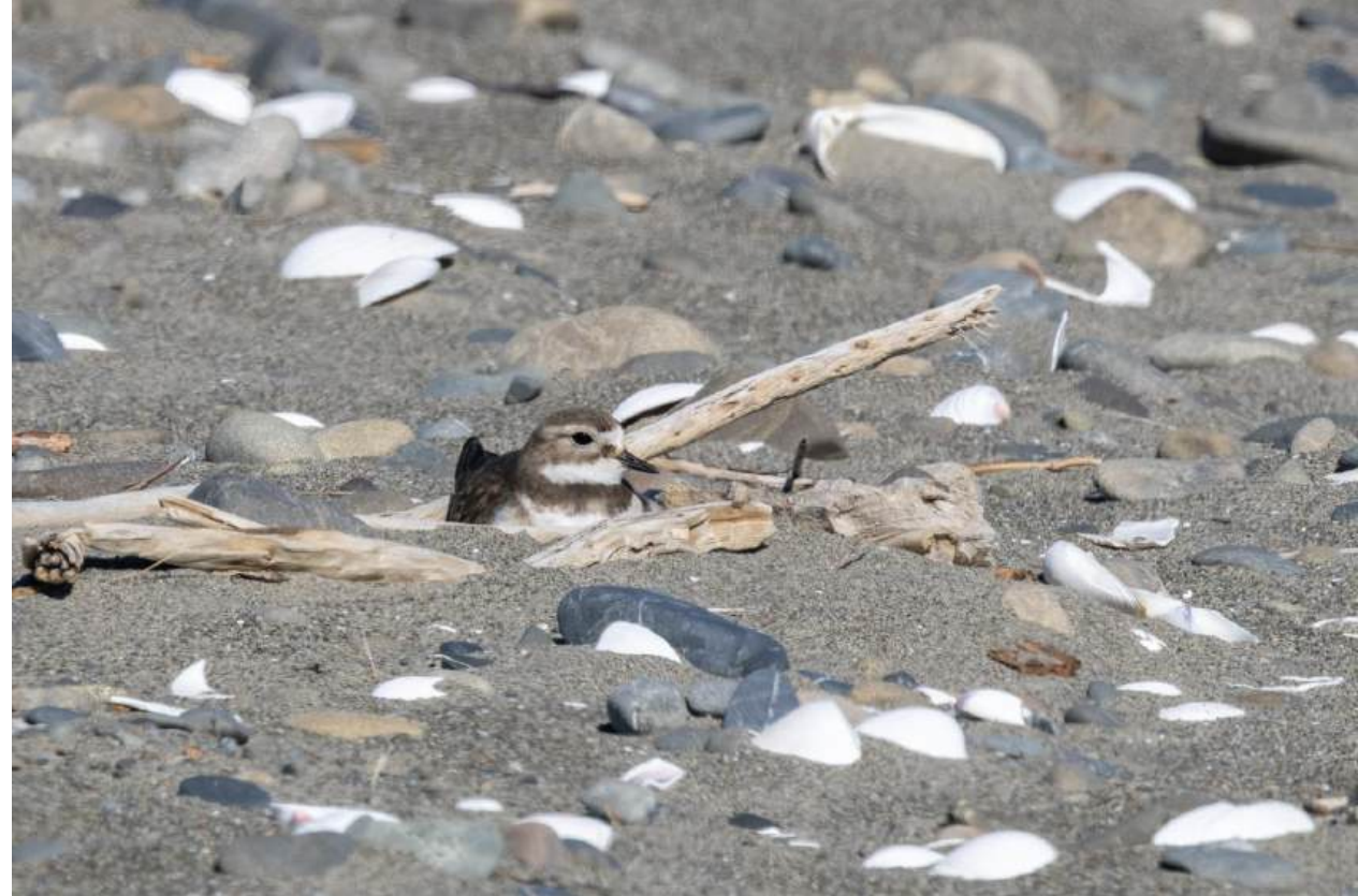
12 October, 10.20am. Banded dotterel on nest.