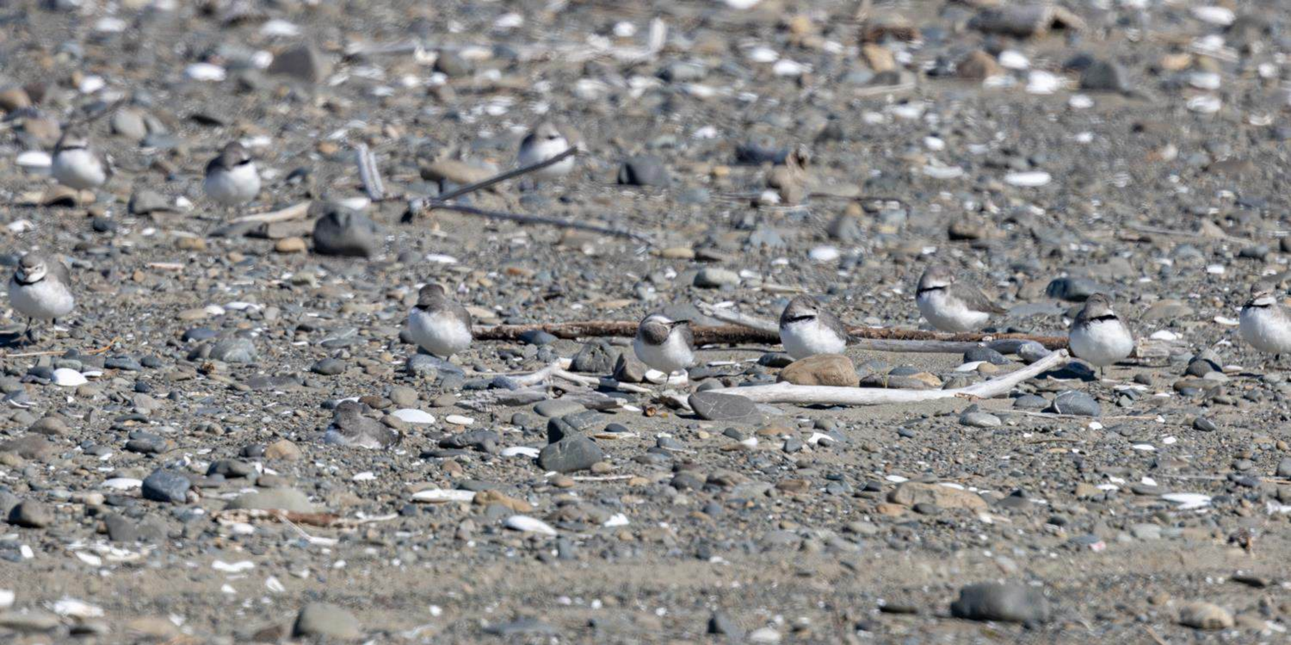
12 October, 10.23am. Roosting wrybill, very hard to see, in BBG and WFT area.