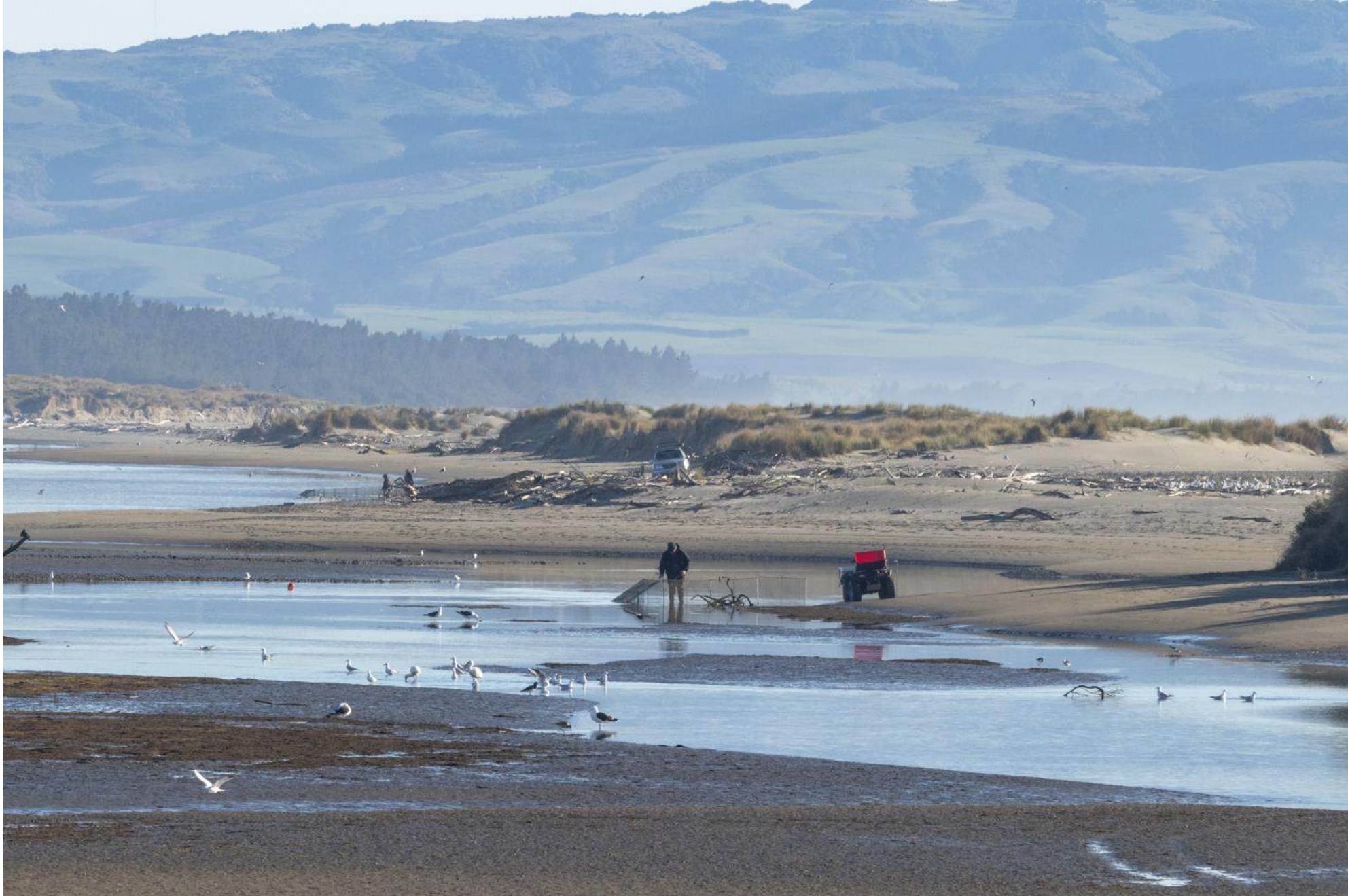
12 October, 8.31am. Quadbike and 4WD on estuary edge.