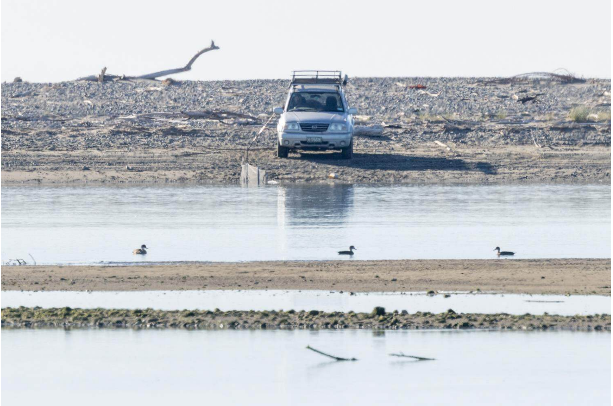
11 October, 8.59am. 4WD on sandspit edge of estuary.