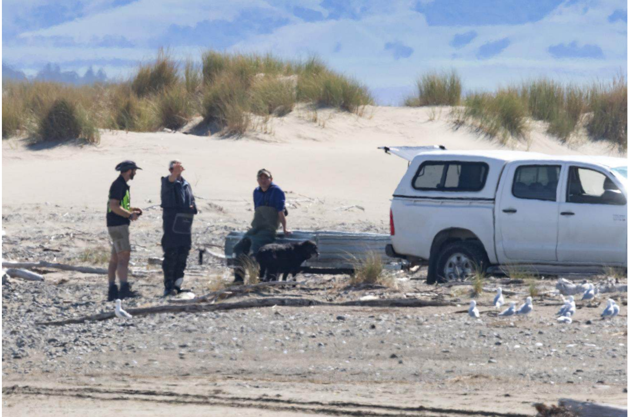
12 October, 11.01am. ECan ranger (extremely professional and efficient) speaks to the fishermen, all pack up and leave.