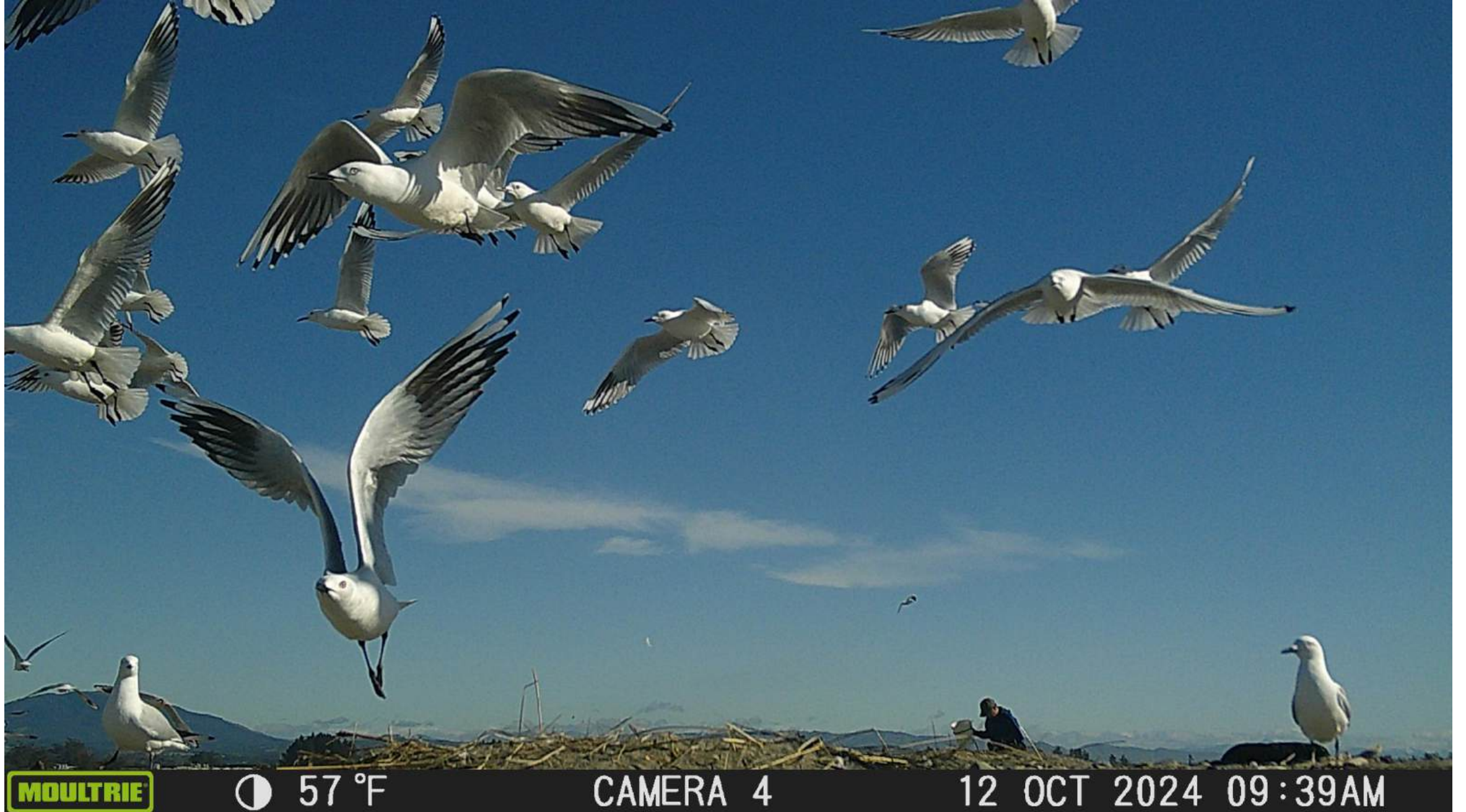
12 October, 9.39am. Trail camera shows birds scared by whitebaiter.