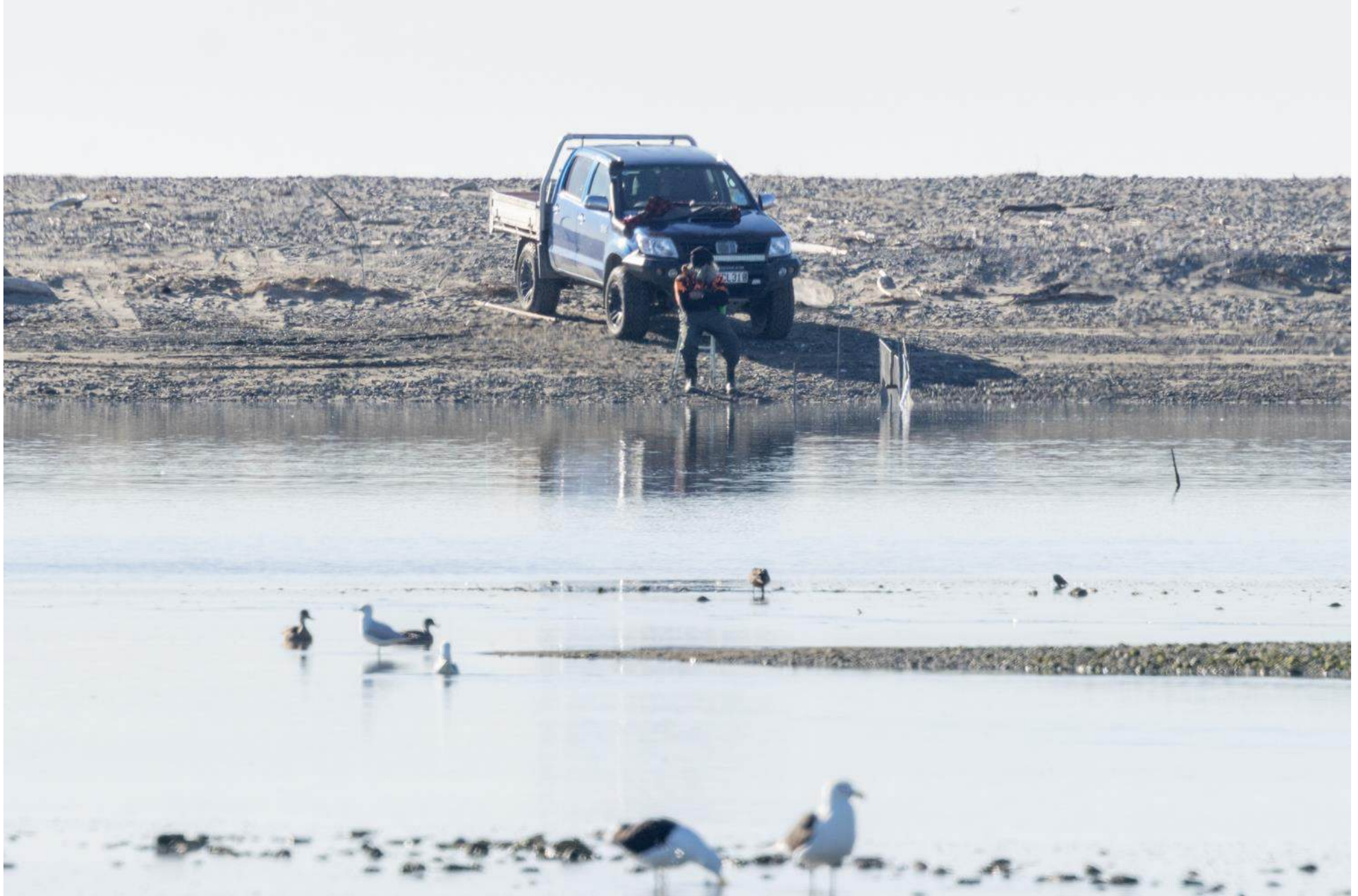
11 October, 8.59am. 4WD on sandspit edge of estuary.