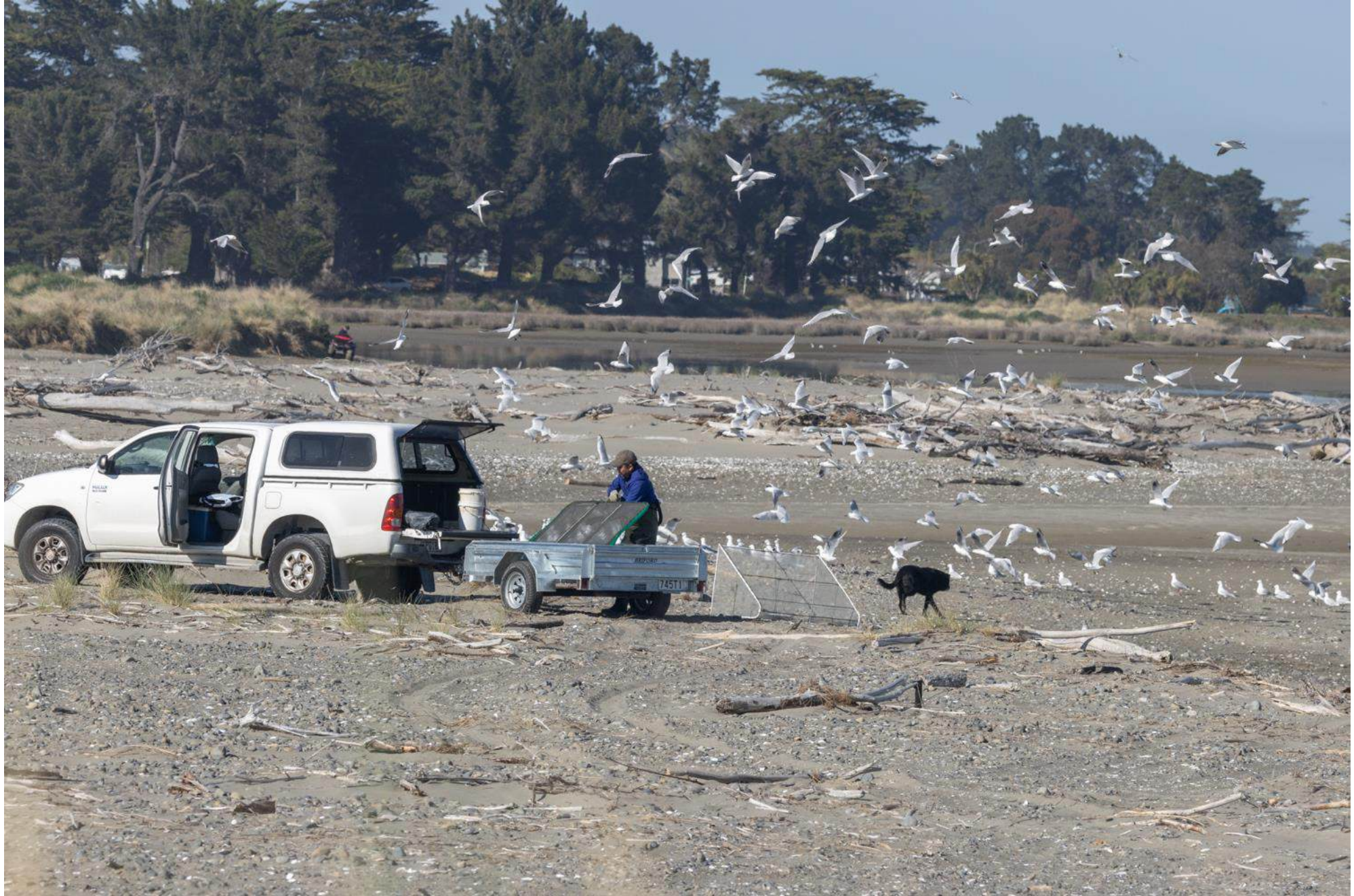
12 October, 9.39am. Further bird scaring, dog goes to help.