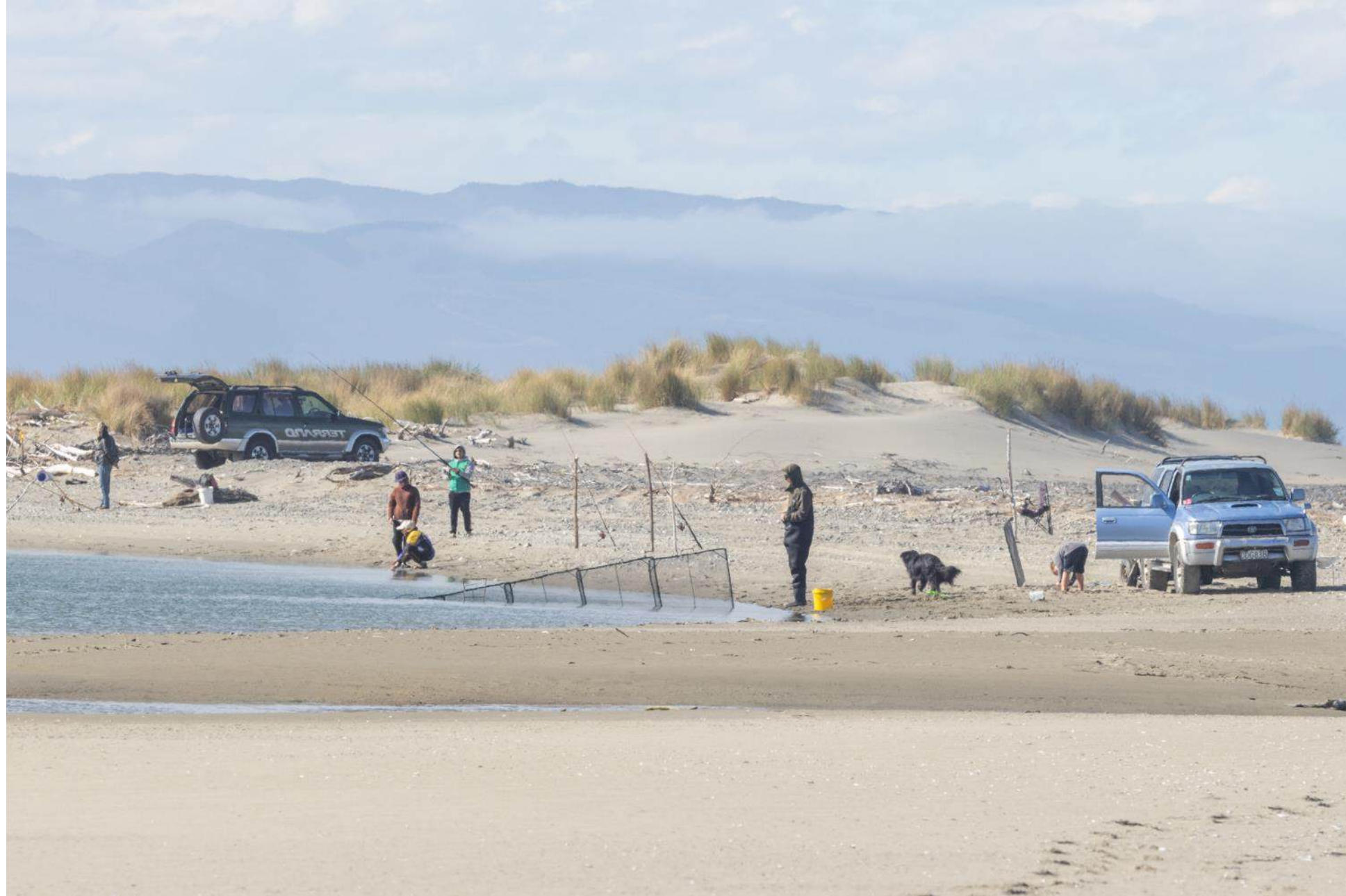
5 October, 4.21pm. 4WDs and dog on estuary side of sand spit.