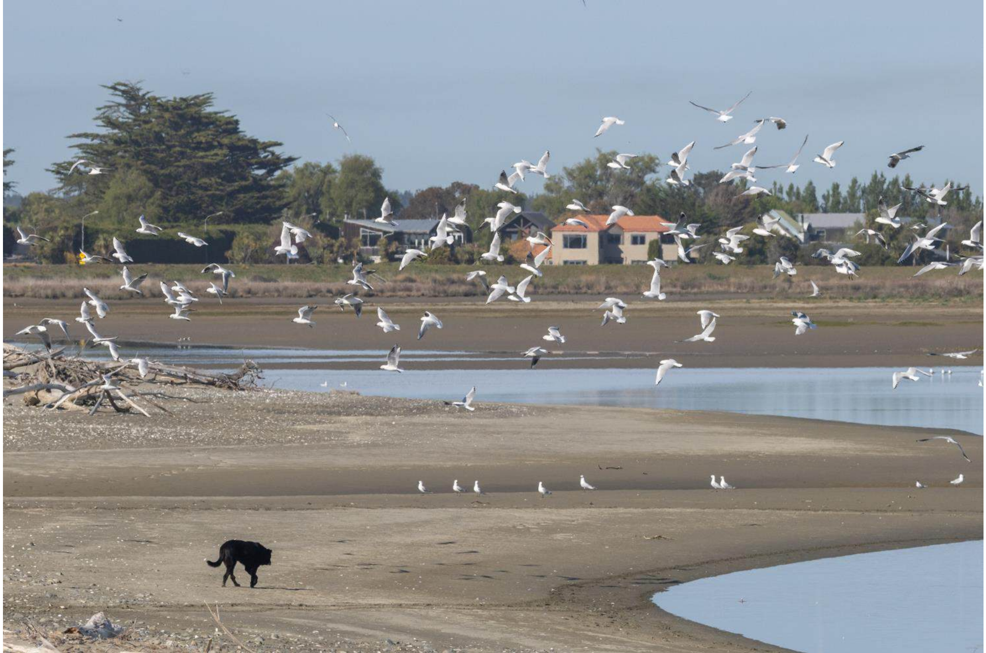
12 October, 9.39am. Further bird scaring, dog goes to help.