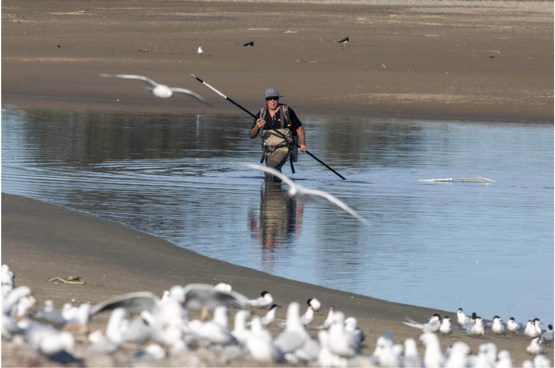
12 October, 9.19am. Whitebaiter moves toward BBG and WFT.