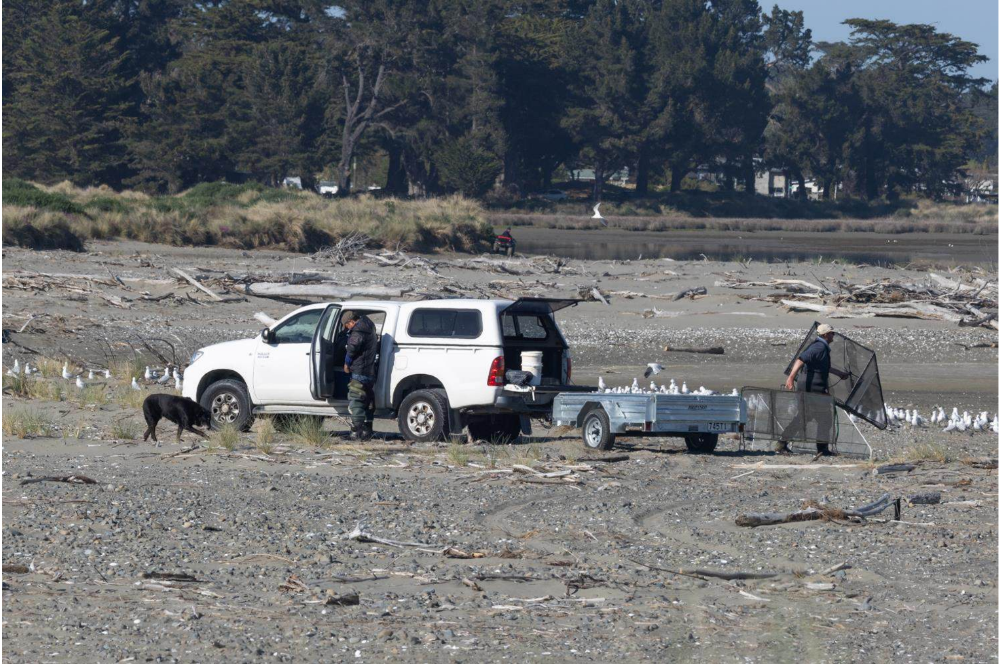
12 October, 9.37am. Rapid deployment of whitebait nets, approx. 10m from BBG and WFT. Dog present.