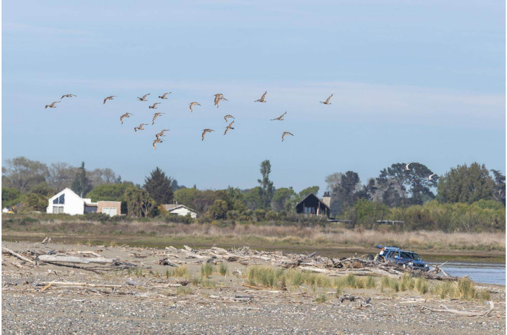
12 October, 10.09am. More godwits arrive to roost at higher tide.