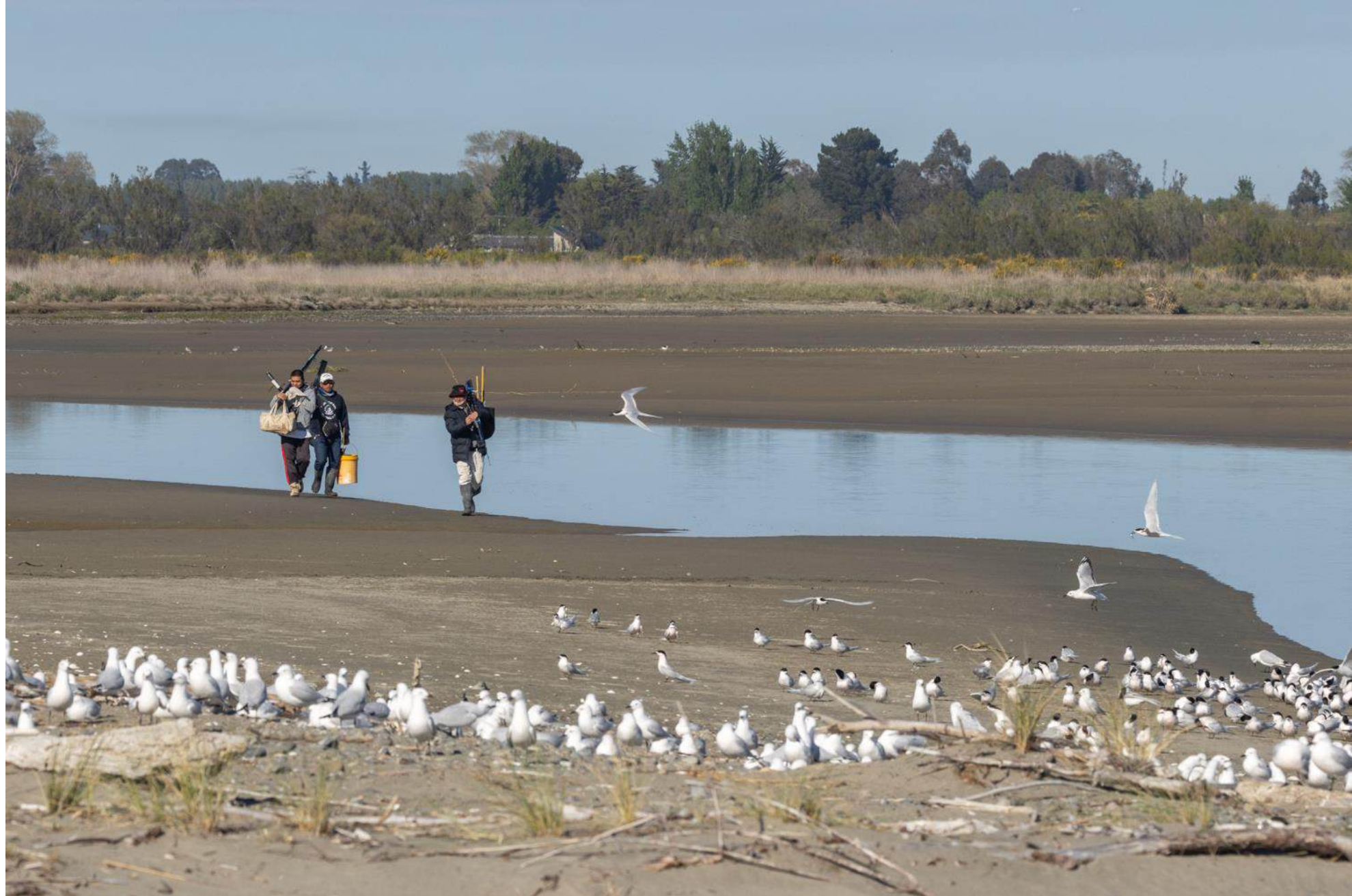
12 October, 9.31am. Fishermen approach BBG and BFT.