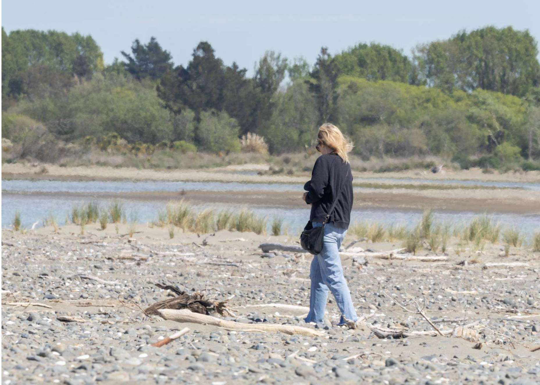
11 October, 1.02pm. Pedestrian within centimetres of banded dotterel nest. She could not have known of the nests.