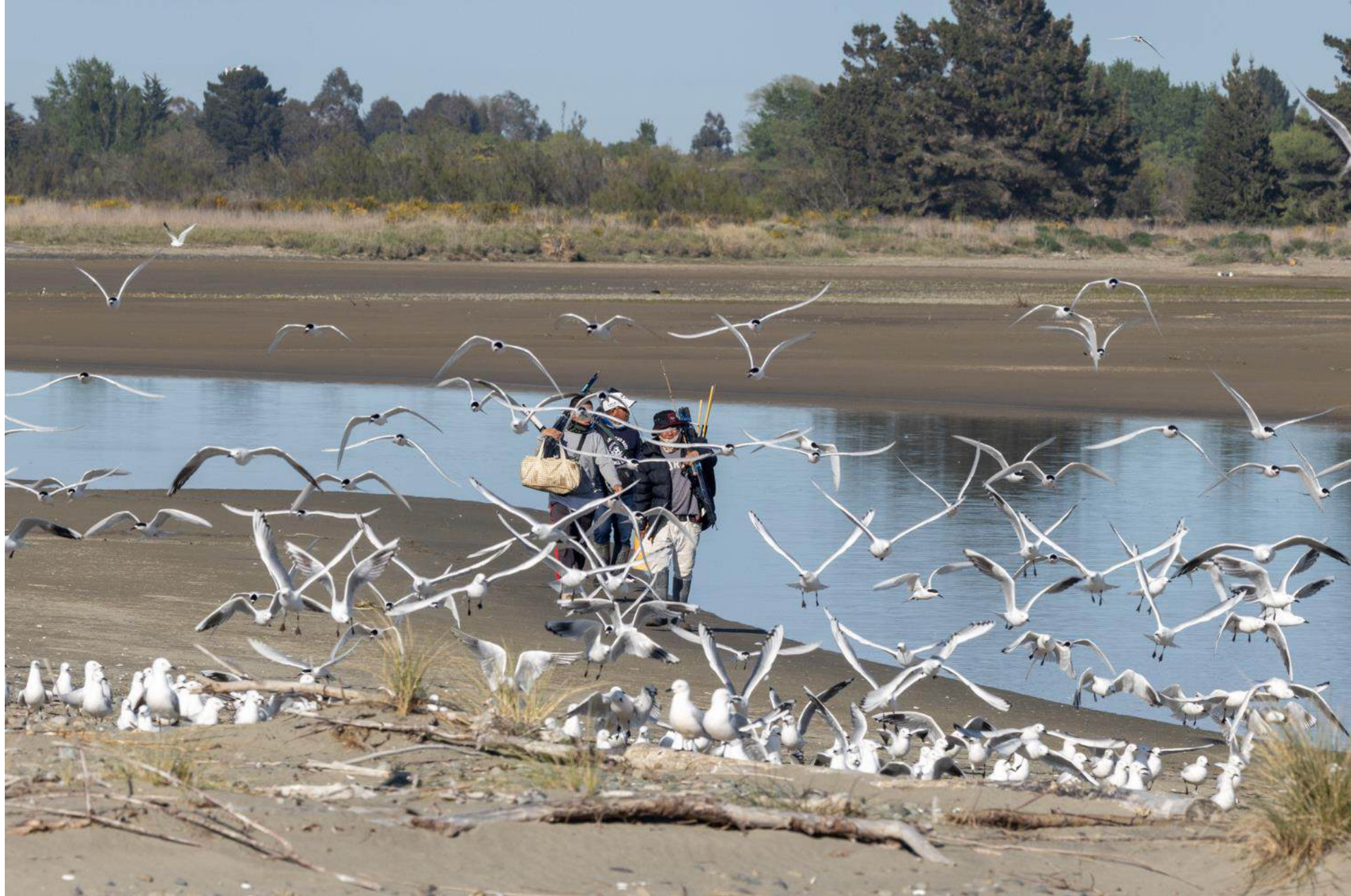
12 October, 9.32am. Fishermen scare BBG and BFT.