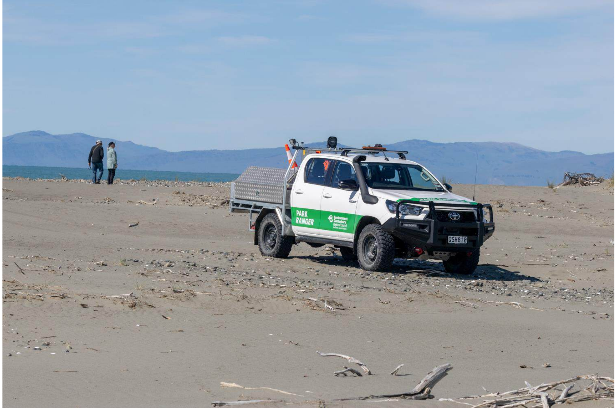
12 October, 11.07am. ECan ranger arrives.