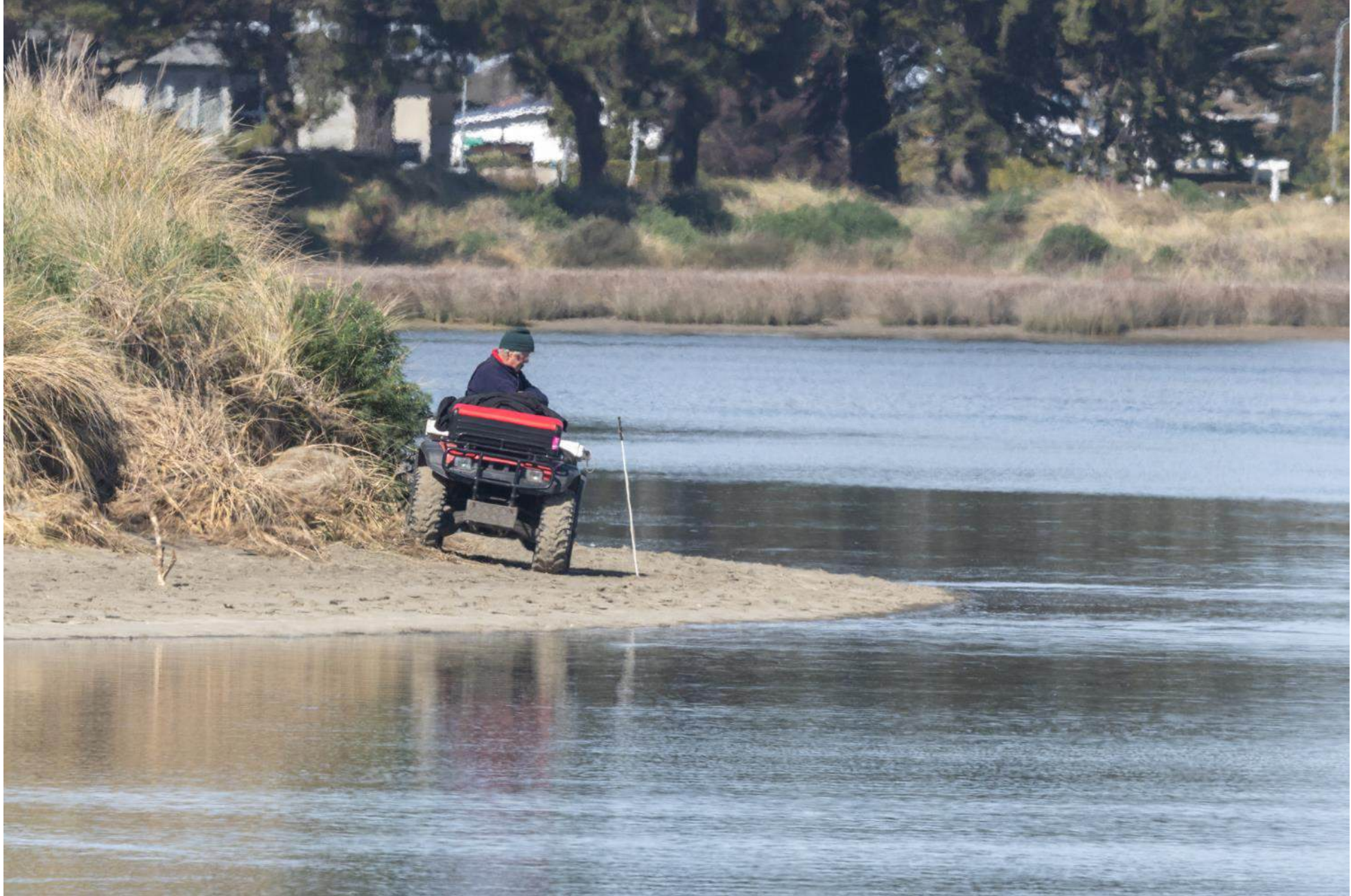
12 October, 10.51am. Quadbike whitebaiter.