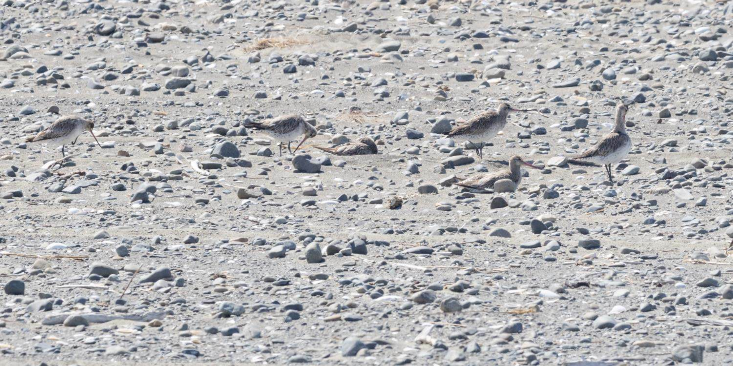
11 October, 12.22pm. Godwits on ground near gulls and terns.