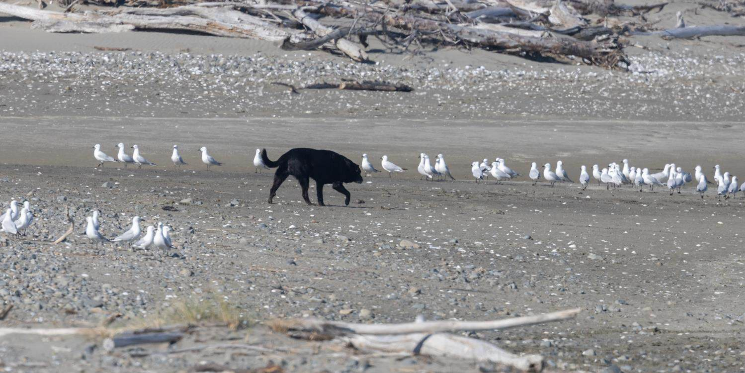
12 October, 9.42am. Dog walks sedately through birds, not all dogs behave like this.