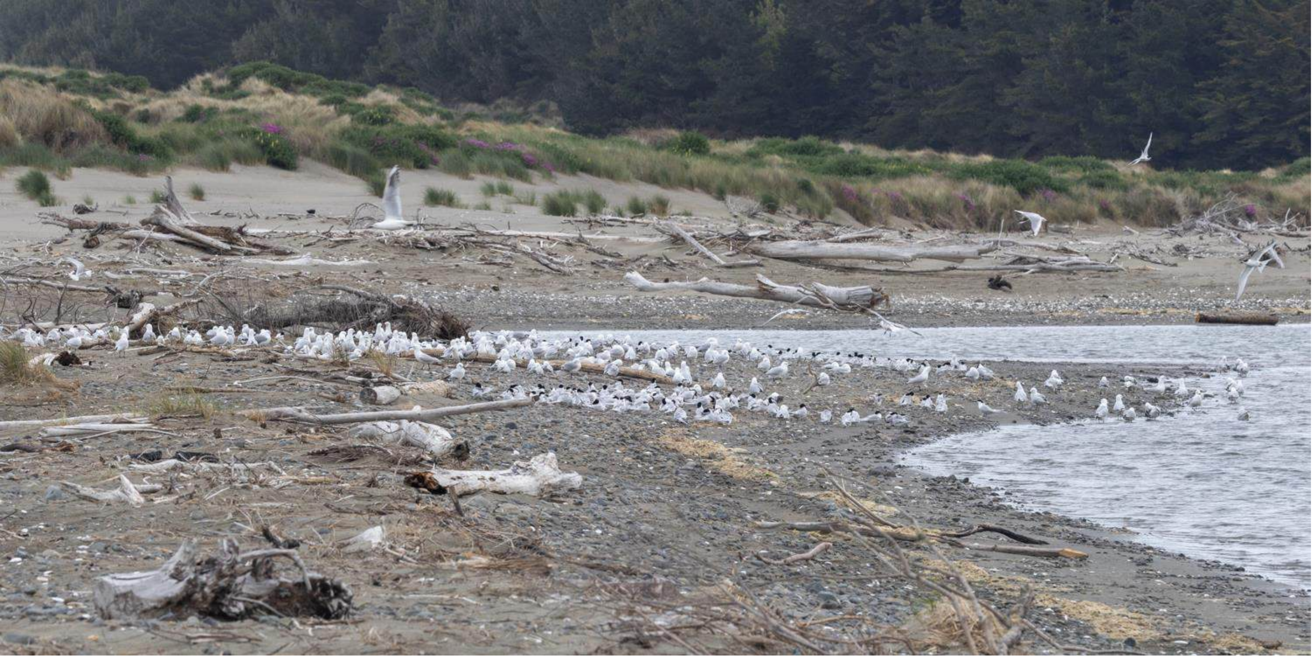
13 October, 3pm. Fewer BBG, more WFT (400??). Incredibly resilient birds.