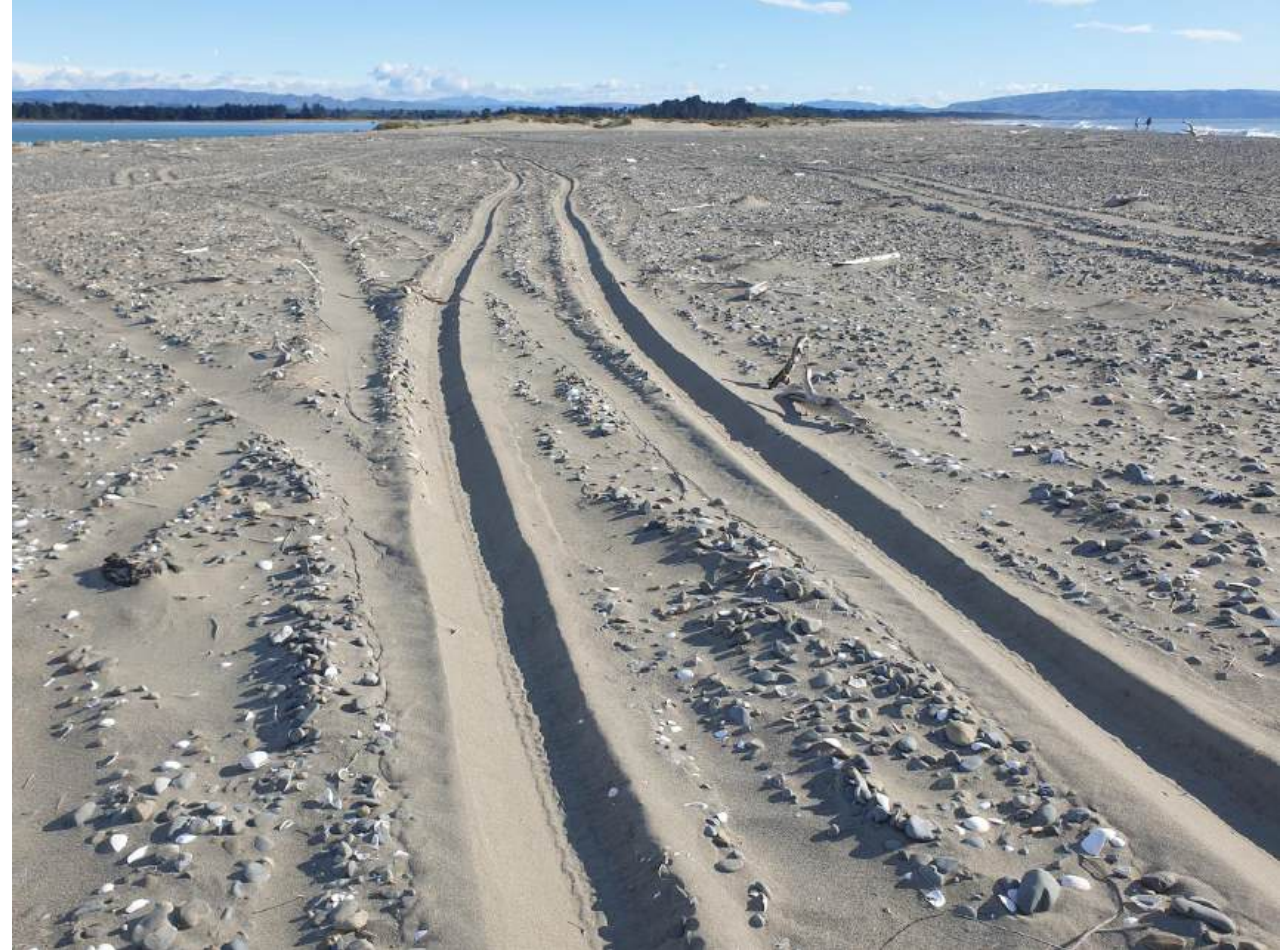
9 October. 4WD tracks in prohibited area.