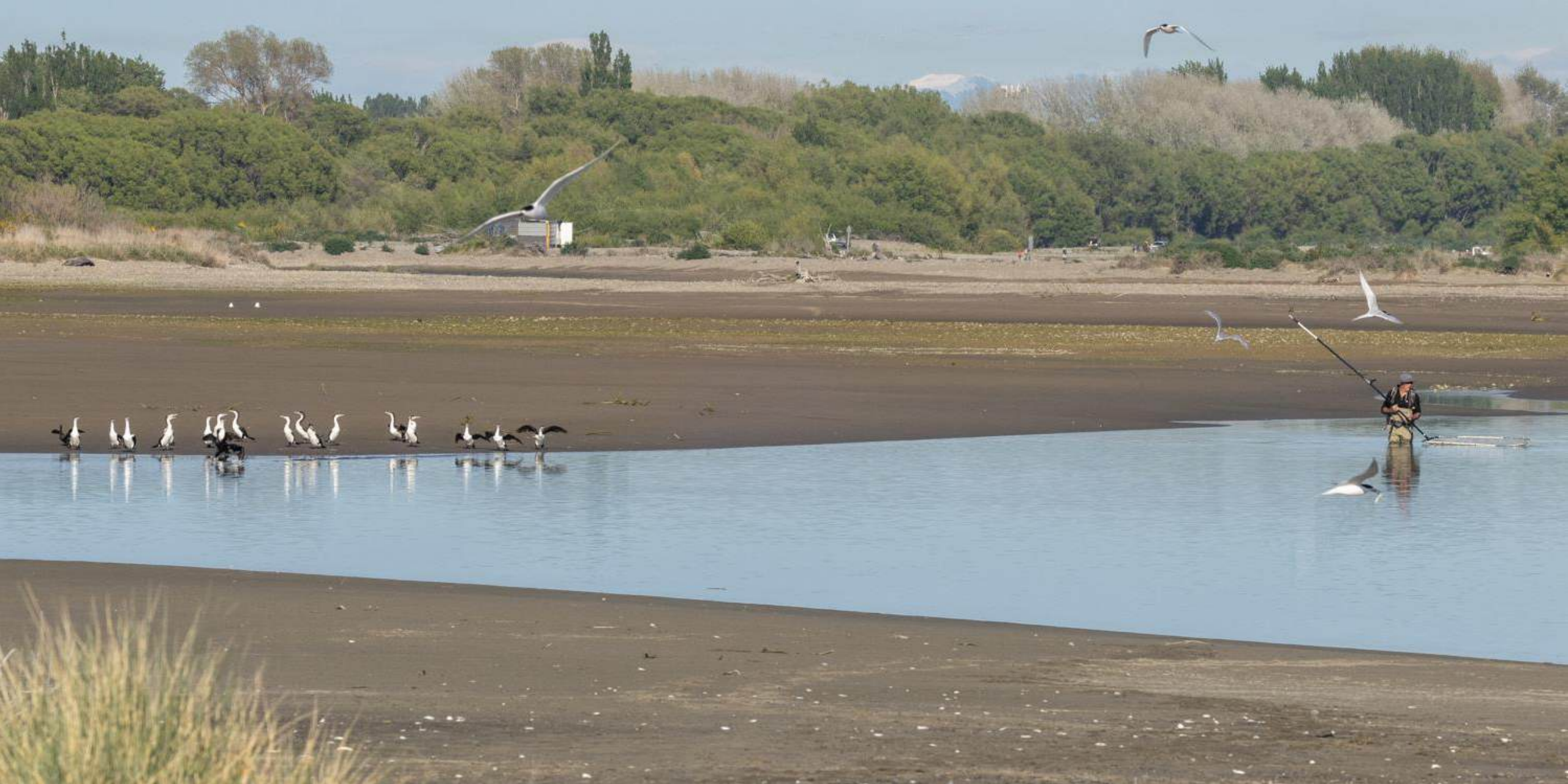
12 October, 9.11am. Whitebaiter moves toward pied shags.