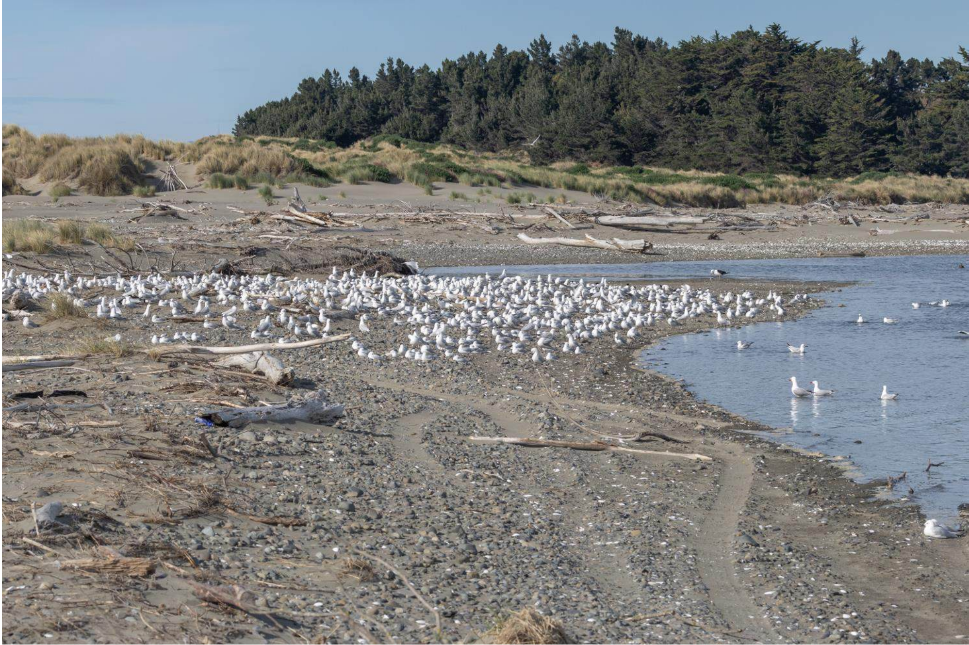
9 October, 9.36am. BBG and BFT.