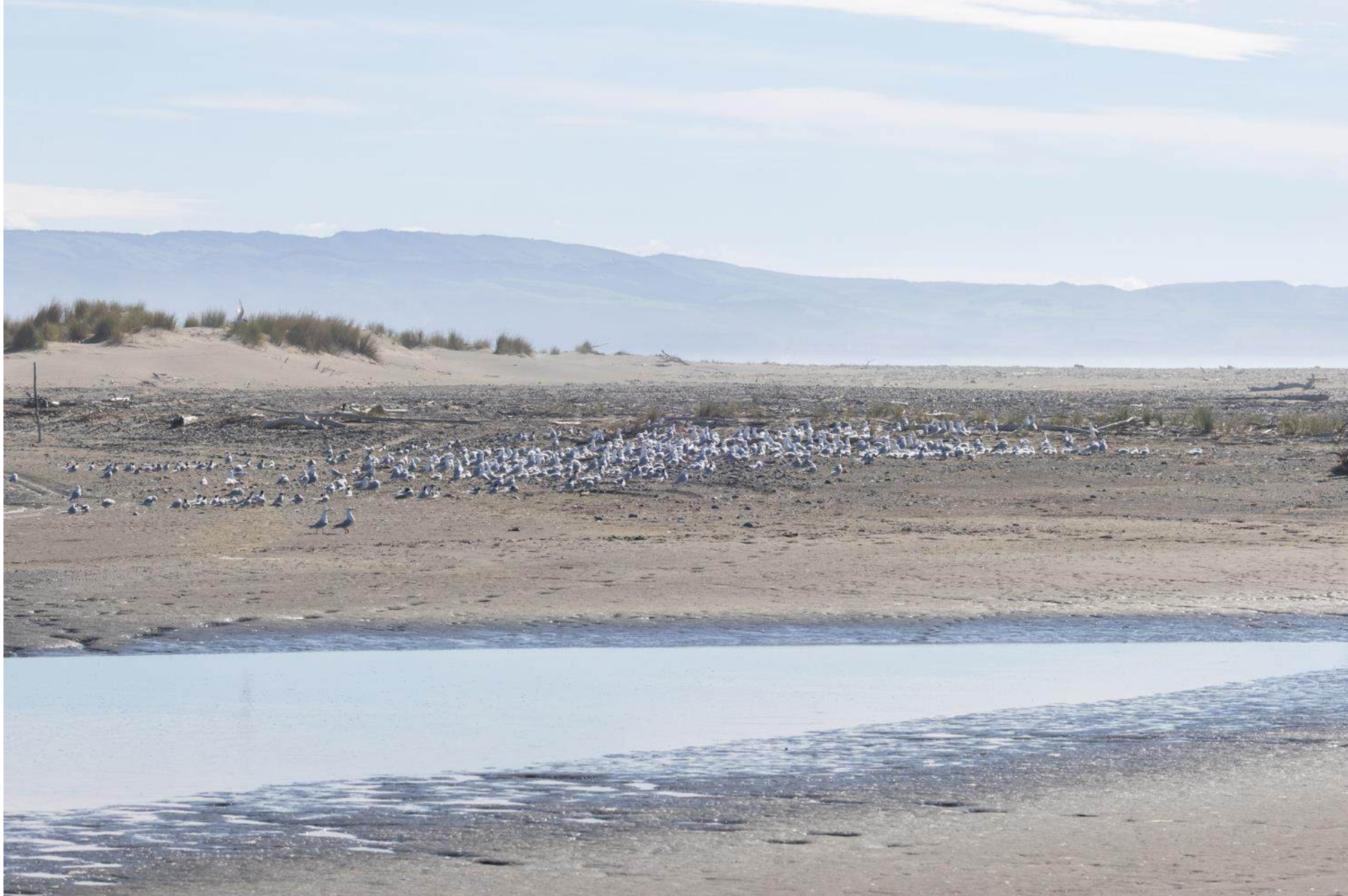
6 October, 10.12am. Black-billed gulls (BBG) and white-fronted terns (WFT), pre-nesting.