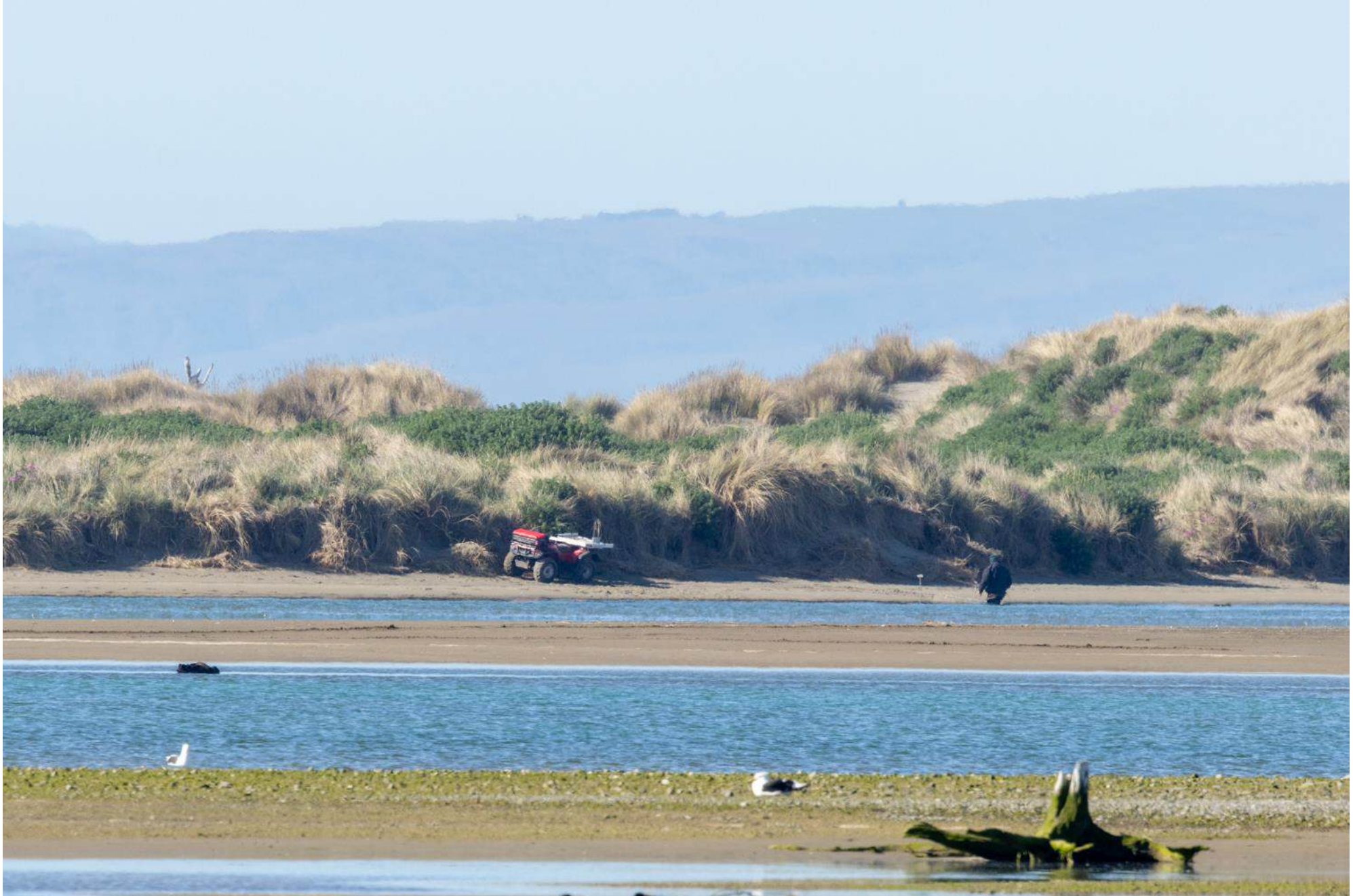
11 October, 9.57am. Quadbike on edge of estuary by sand dunes.