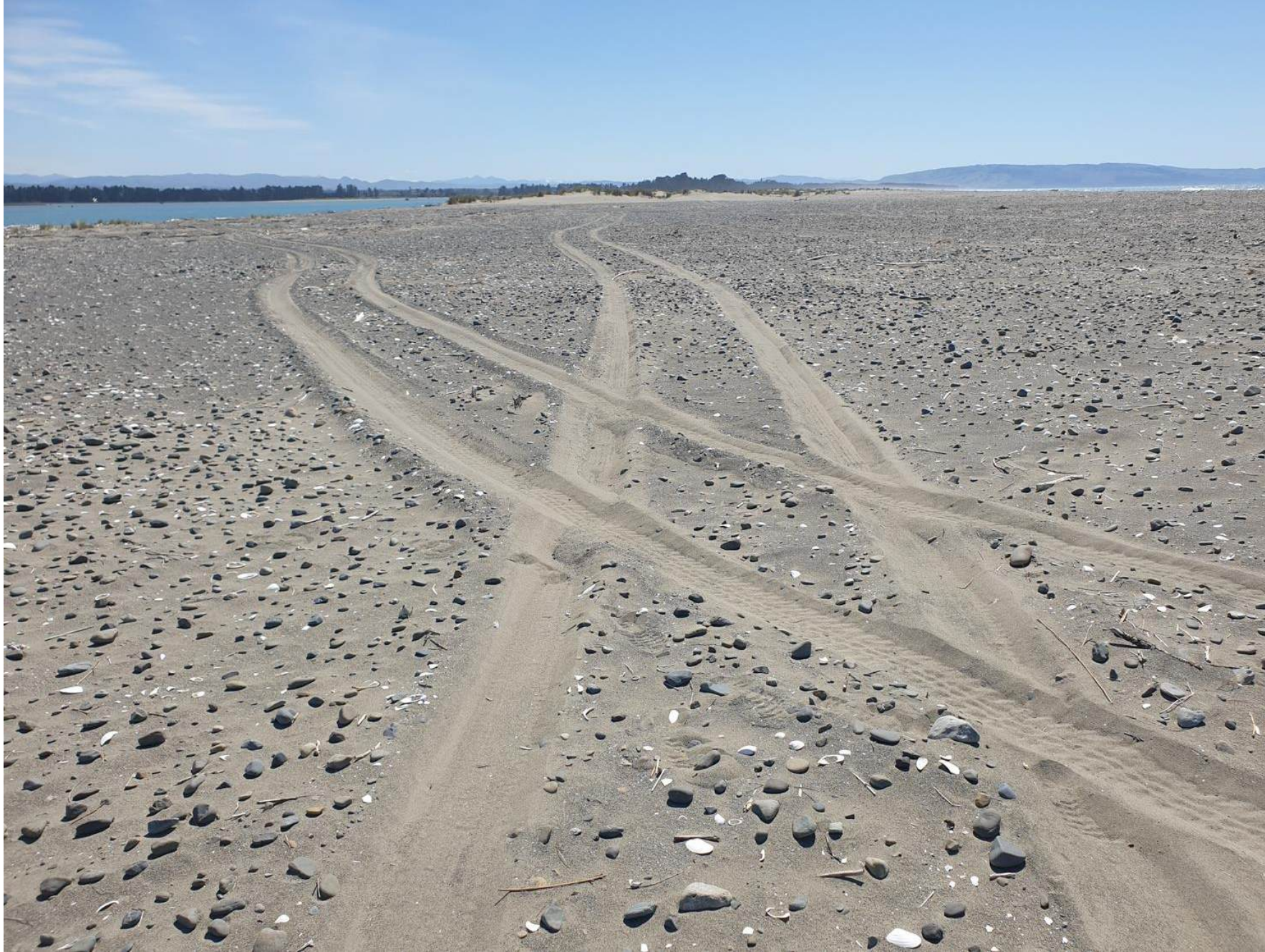
11 October, 12.24pm. 4WD tracks through BD nesting, wrybill and godwit roosting area.