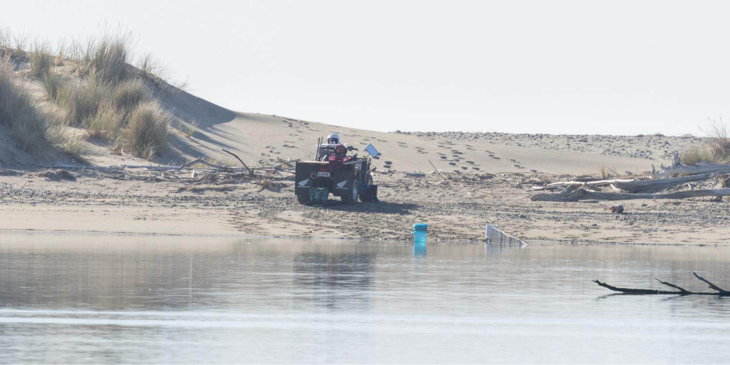
11 October, 8.59am. Quadbike on sandspit edge of estuary.