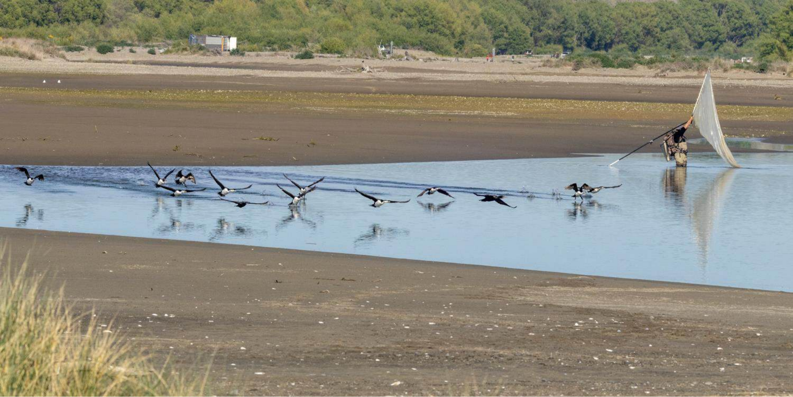
12 October, 9.11am. Whitebaiter scares pied shags.