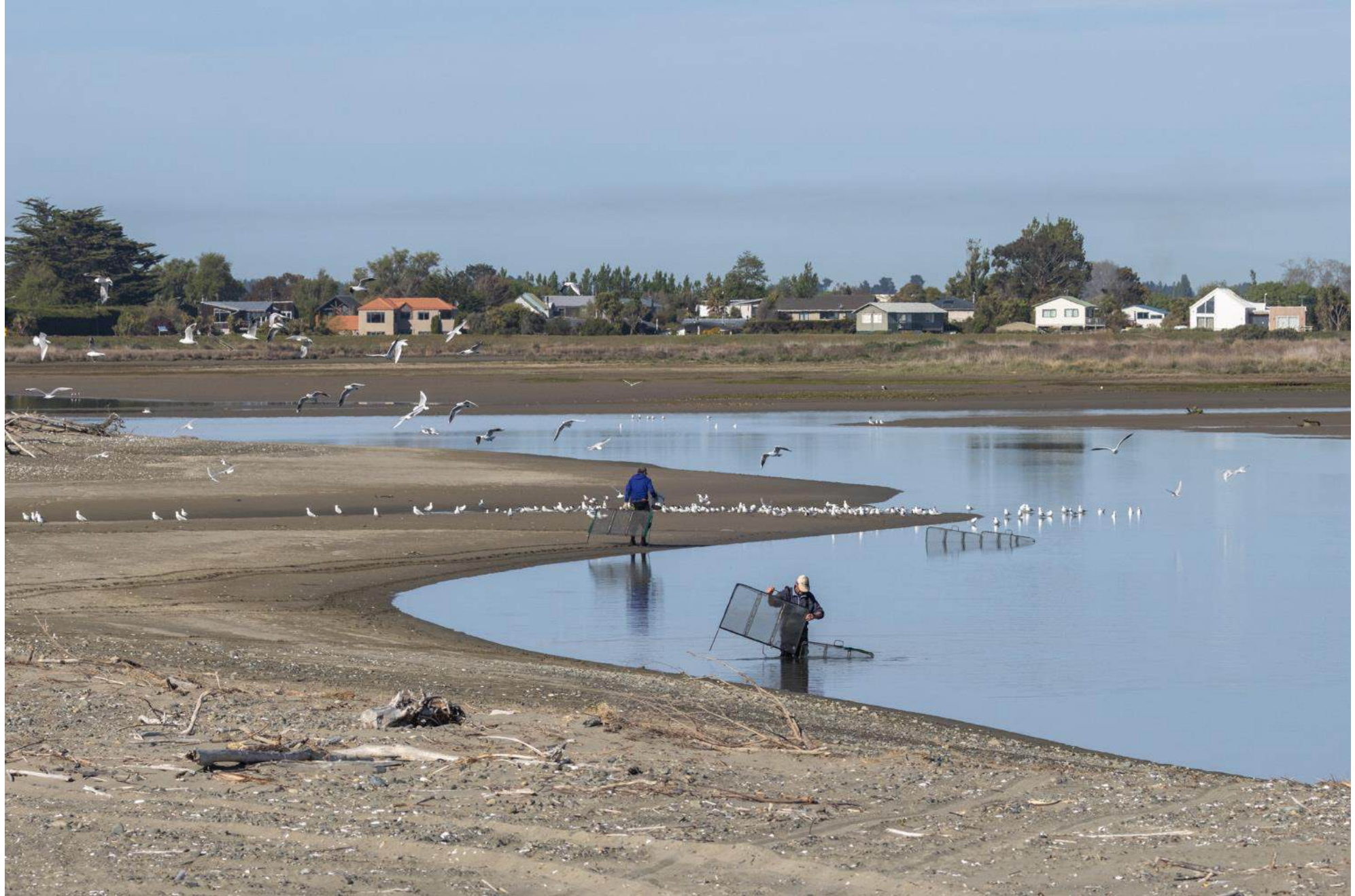
12 October, 9.39am. Completing set up of nets.