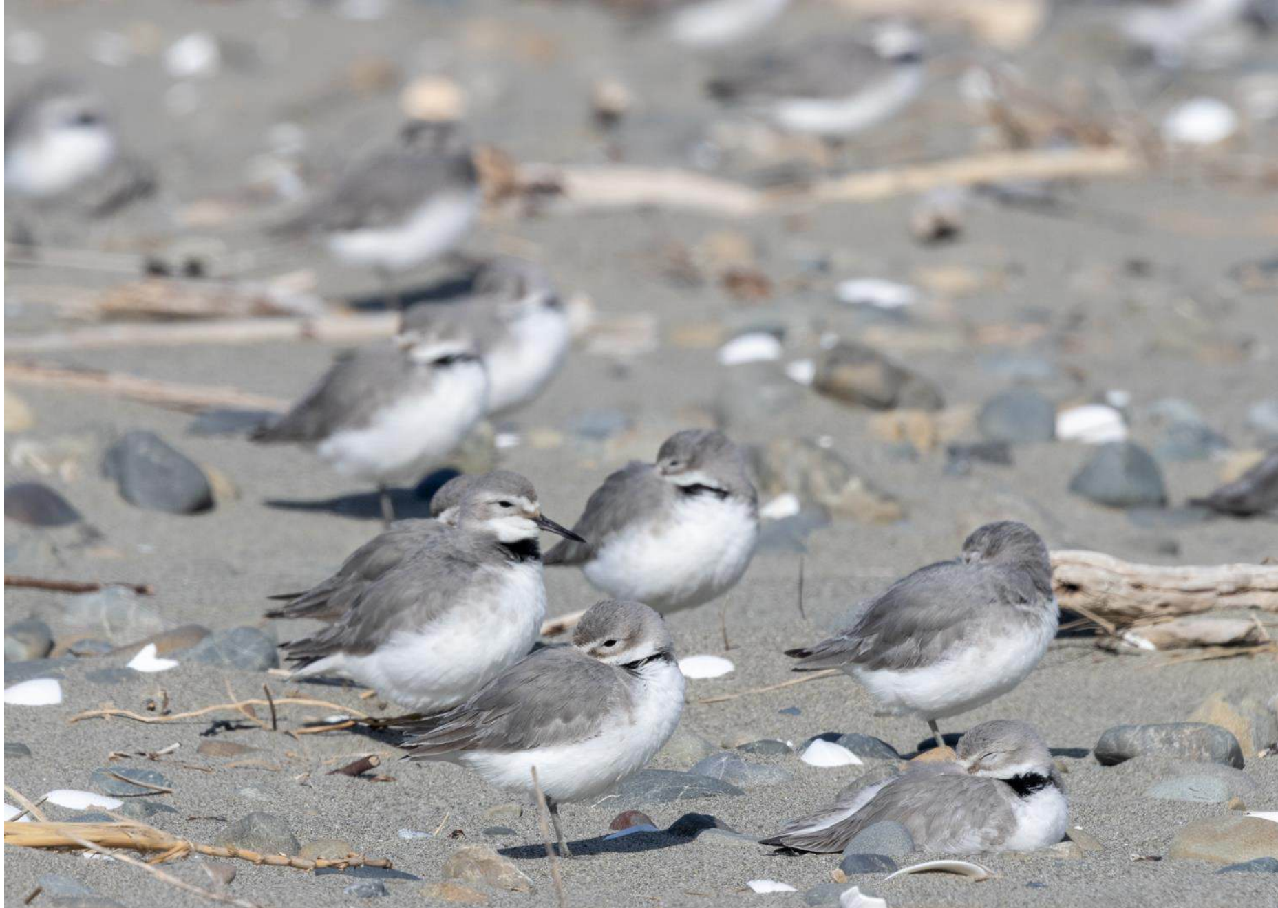
9 October, 9.47am. Wrybill roosting on spit, >70 present.