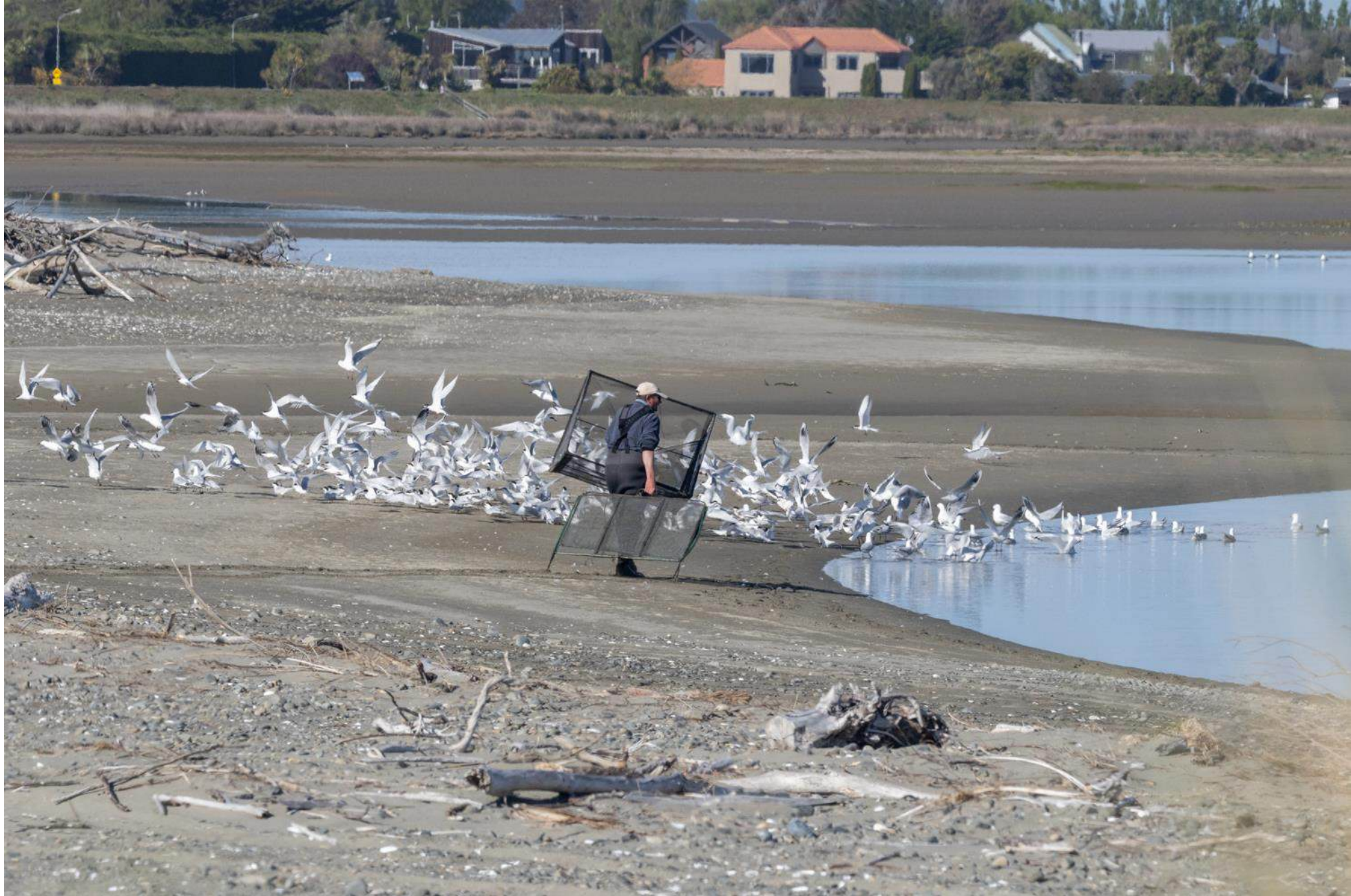
12 October, 9.38am. Deploying nets, through BBG and WFT.