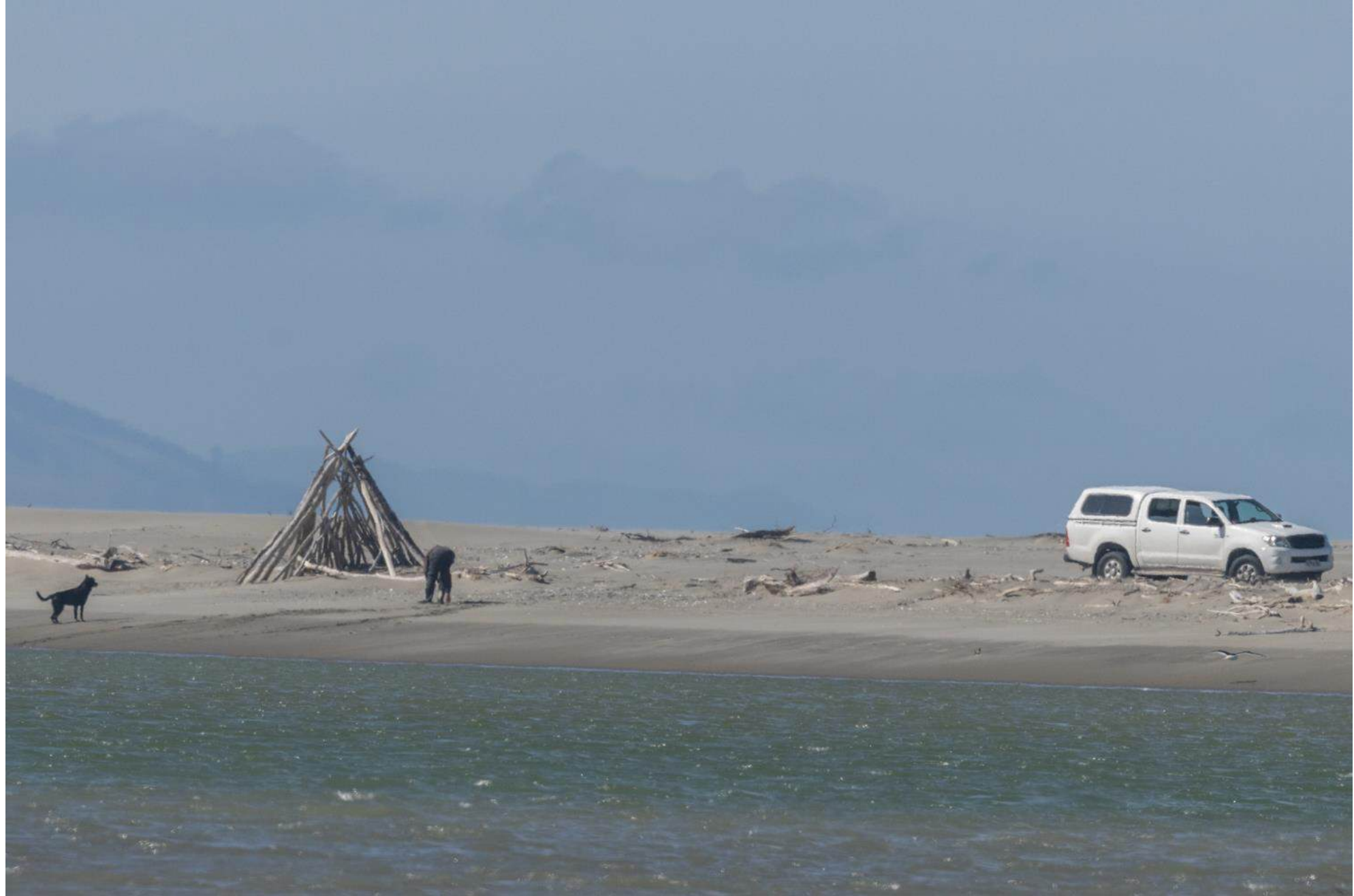
5 October, 3.28pm. 4WD and dog on estuary side of sand spit.