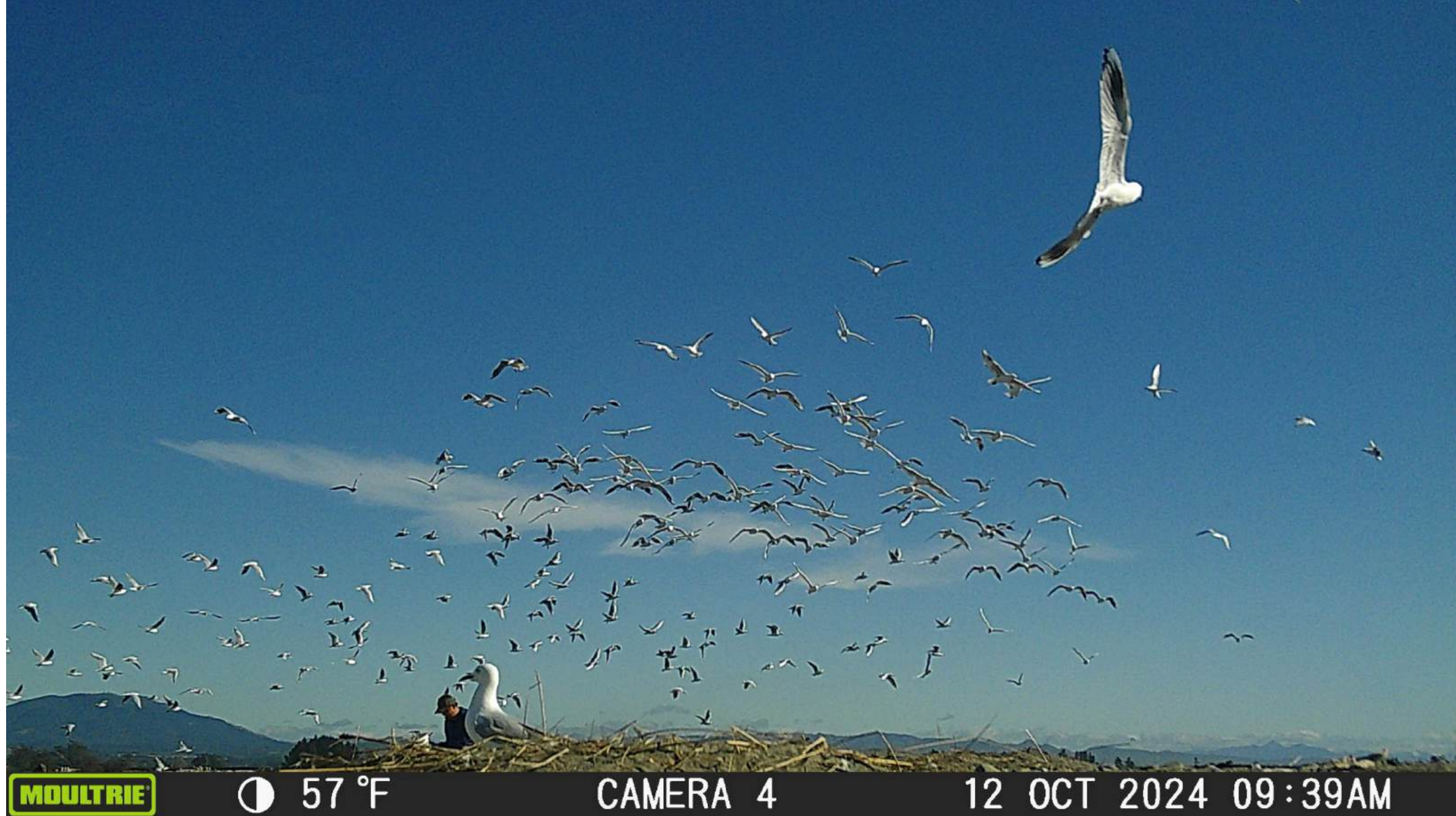
12 October, 9.39am. Trail camera shows birds scared by whitebaiter.