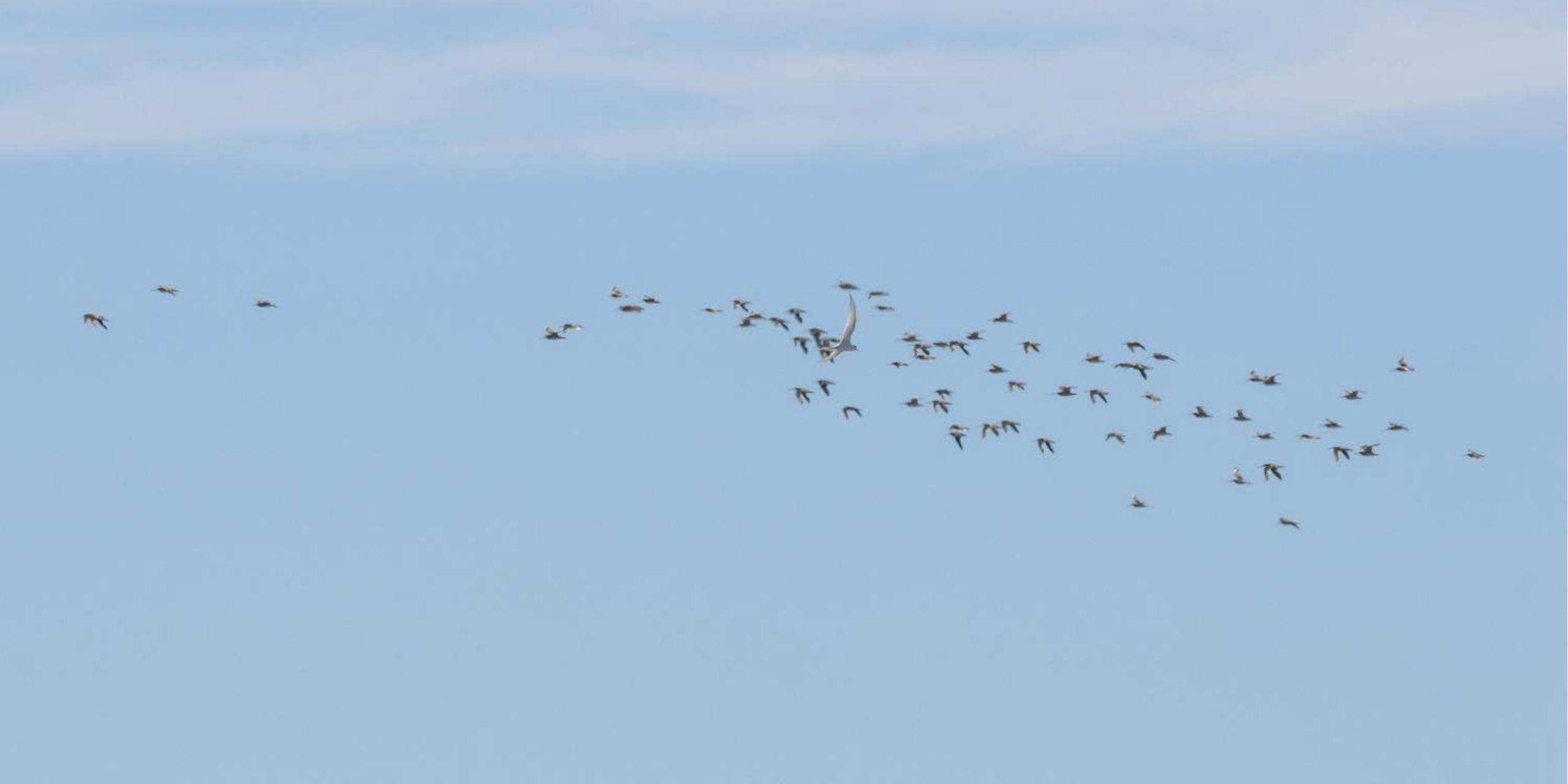
12 October, 12.22pm. Ultralight scares nearly 100 roosting godwits into the air.