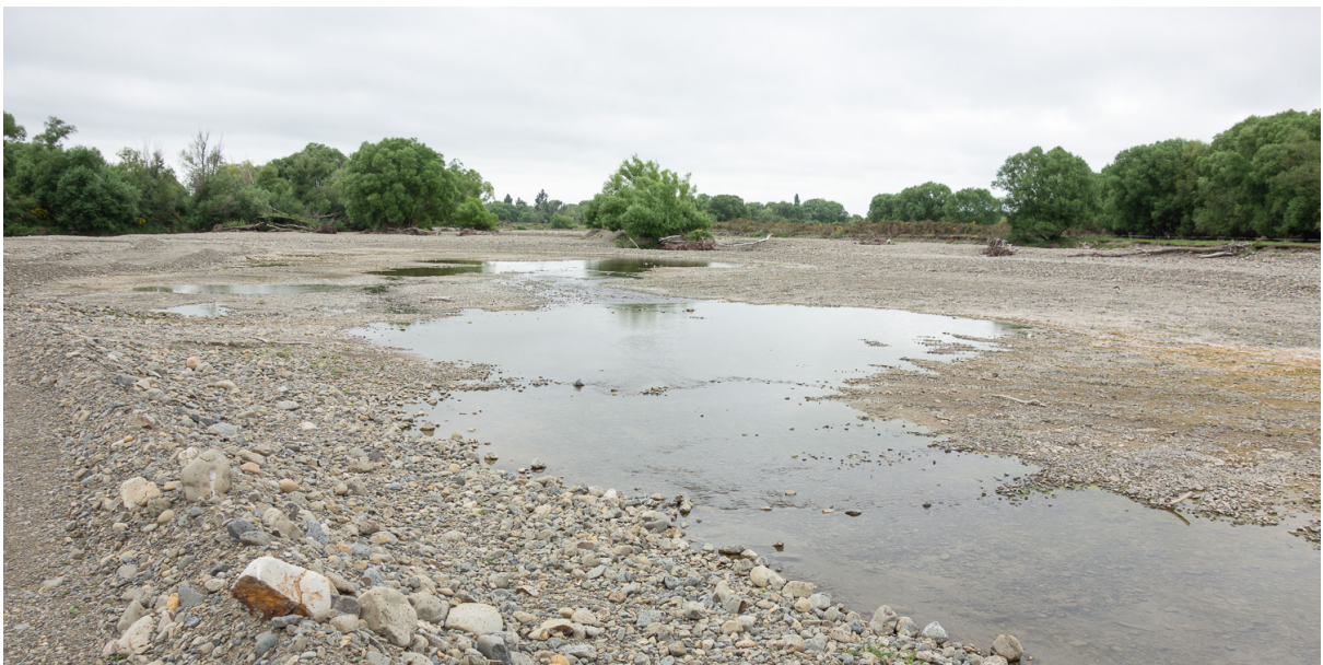
Shallow ponds, gravel extraction area west of Yaxleys Road