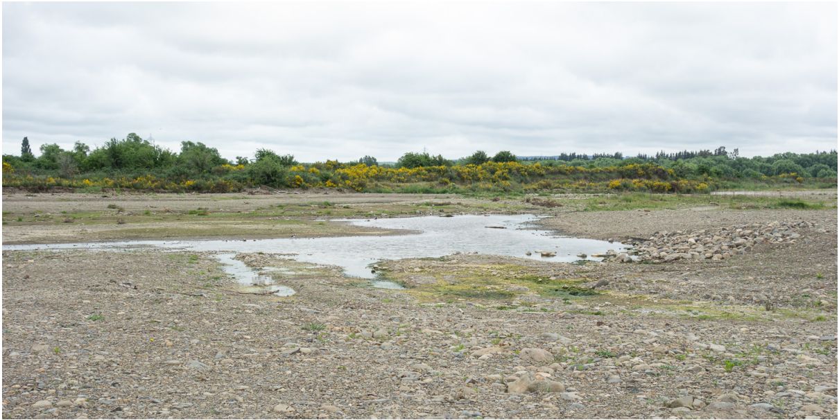
Shallow ponds from gravel extraction, Grey River