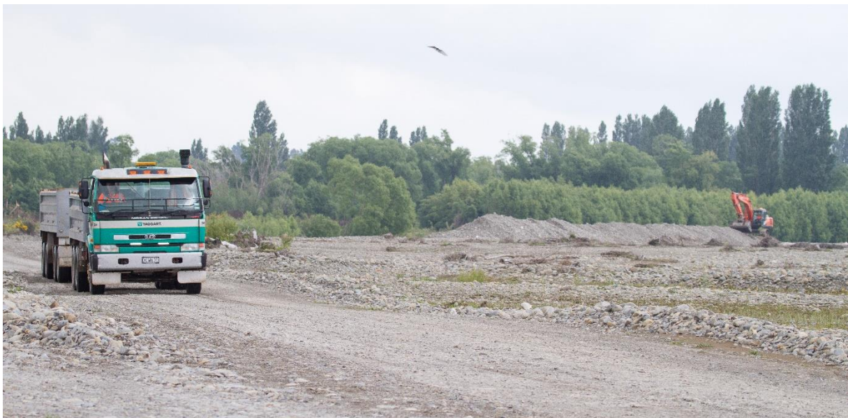
A Taggart Earthmoving Ltd truck and working digger in the Swamp Road extraction site close to where banded dotterels and black-fronted terns were nesting.