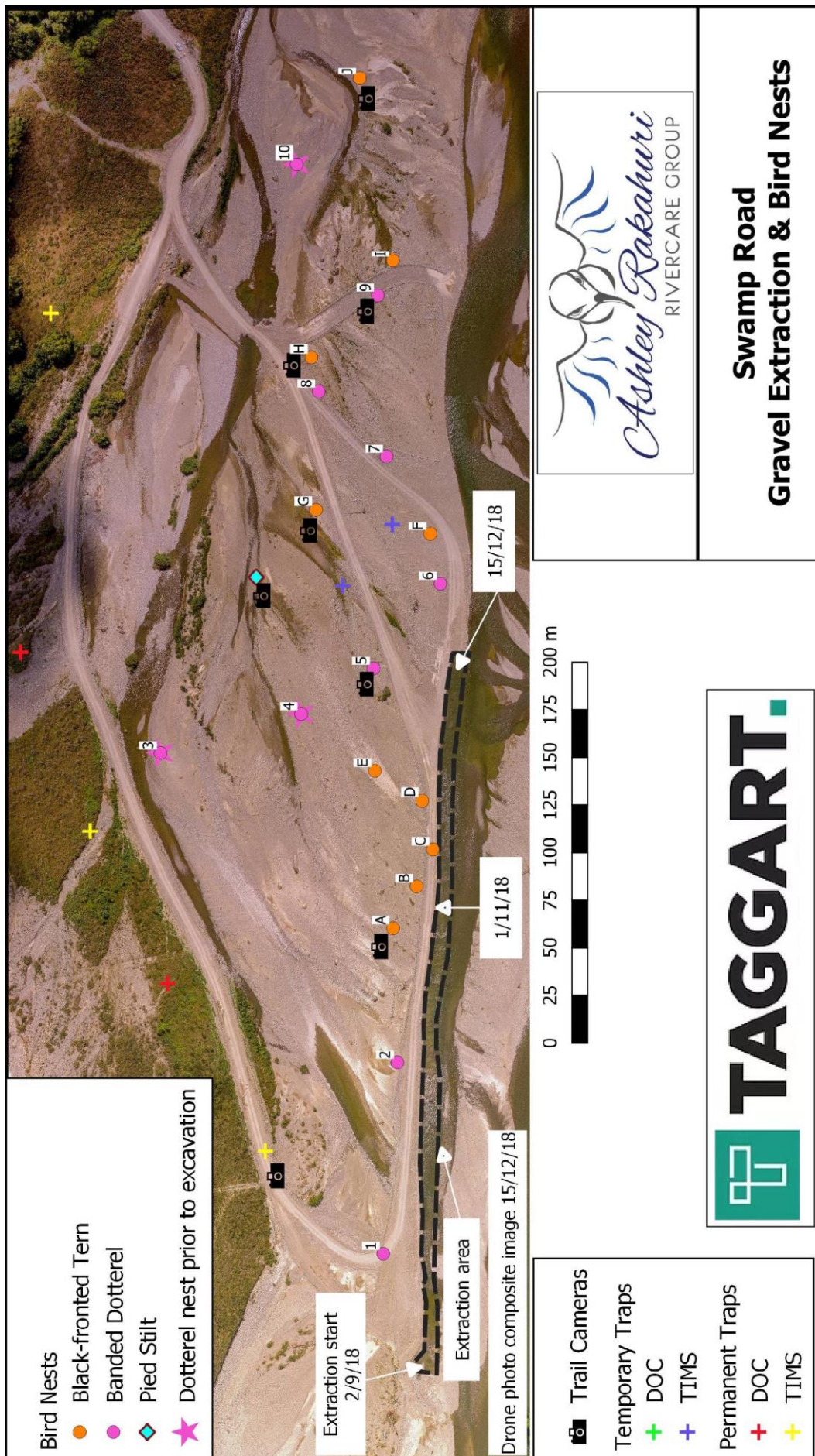
Map 1. Gravel extraction activities and bird nests